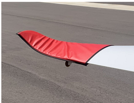
Pipistrel Taurus & Electro Wingtip Pads

Designed to prevent damage to the wingtip in crowded hangars or high traffic areas, these products are made of bright red Naugahyde and thickly padded with a sandwich of closed cell foam. Protects delicate winglets, casters and their housings, and soft finishes.