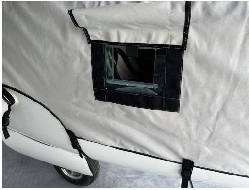
Pipistrel Taurus Complete Cover Set