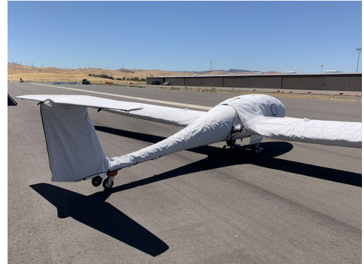
Pipistrel Taurus & Electro Empennage Cover, Incl. Horiz. Stab., All Year Use