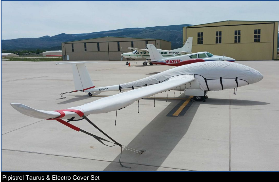
Pipistrel Taurus &amp; Electro Cover Set