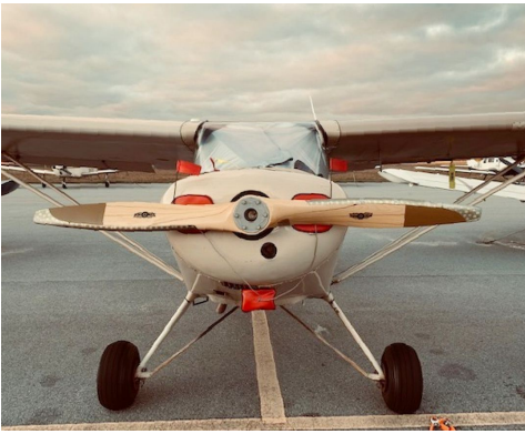
Taylorcraft Engine Inlet Plugs