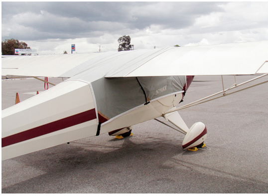
Taylorcraft Over-Top Canopy Cover