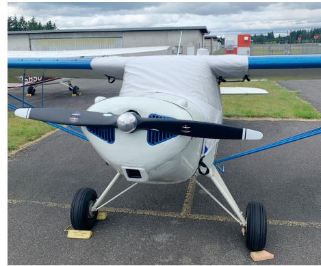
Taylorcraft Models F19 Over-The-Top Canopy Cover