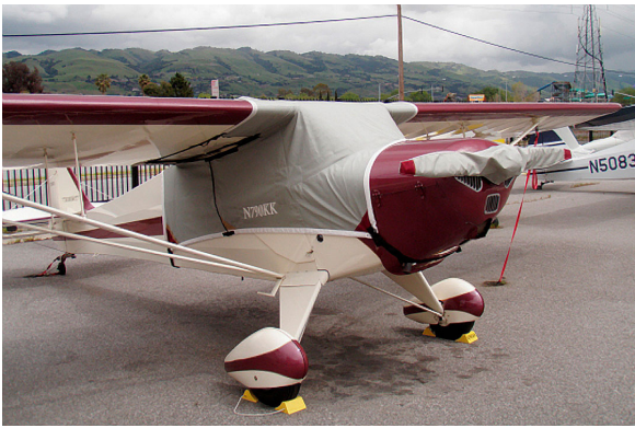
Taylorcraft Over-Top Canopy Cover

This cover type is made from Silver Acrylic Sunbrella canvas and is 100% lined with a soft and smooth microfiber. Bruce's Custom Covers developed this material combination especially for aircraft protection. The outer material is medium weight and treated for water resistance, UV resistance and anti-static buildup. The inner lining is a very soft and smooth microfiber to prevent scratching. The material is very reflective, and tests show that the cabin interior temperature can be reduced to near-ambient temperature on the hottest of days. It is water, ice and snow repellent, yet breathable to allow moisture to escape from between the cover and the aircraft surface.