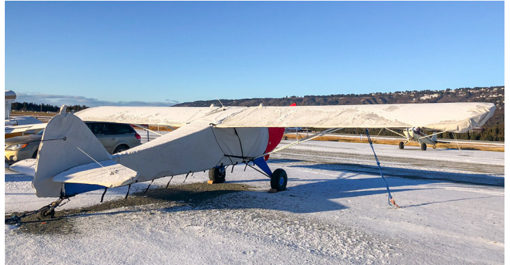
Taylorcraft Aviation Corp F19 Wing Covers