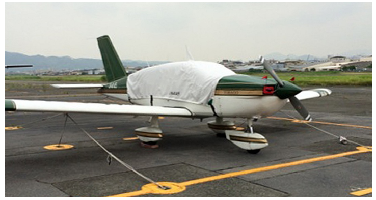
Socata TB-20 Canopy Cover