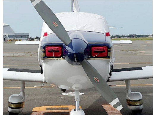
Socata TB10 Engine Plugs