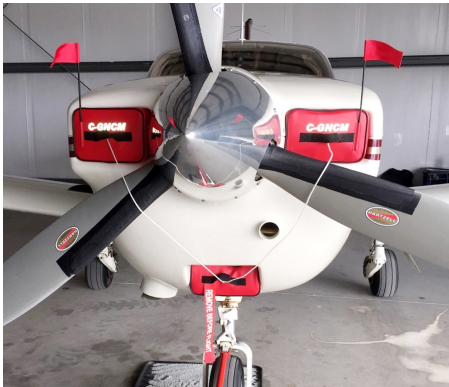
Socata TB-20 Engine Plugs, set of 3

Engine Inlet Plugs are custom fit for your Socata TB9-GT, Tobago: TB10-GT & TB200-GT, Trinidad: TB20-GT, TB21-GT intakes, made with heavy-duty vinyl material, and stuffed with a single block of sculpted urethane foam. Each plug has a zipper that allows the foam to be removed and dried if necessary. Engine plugs have warning flags that are visible from the cockpit or 'remove before flight' streamers sewn onto the face of the plugs. Most plugs are imprinted with the aircraft registration number in black for an extra charge. Storage bag NOT included. Engine plugs may be inserted after flight when the engine is still warm. Engine Inlet Plugs are commonly referred to as Cowl Plugs, Intake Plugs, Cowl Blocks, Engine Blocks, and Engine Bungs.