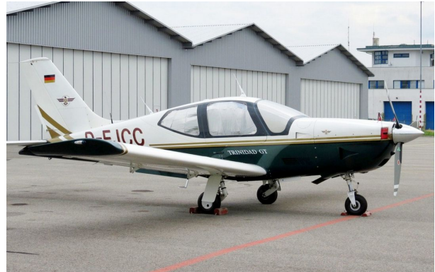
Socata Tobago TB20 Heatshields