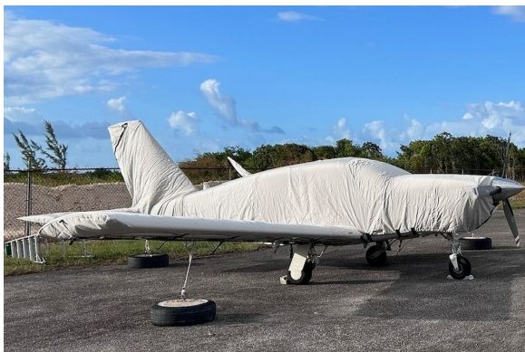
Socata TB-20 Trinidad Complete Cover Set

WINTER USE MATERIAL - Made with Solution-Dyed Polyester fabric, this option is intended for seasonal use to aid in deicing, rain mitigation, or for occasional travel. The material is lighter and more compact, but more susceptible to UV damage and may have a shorter useful life if used continuously outside than the all-year use material.