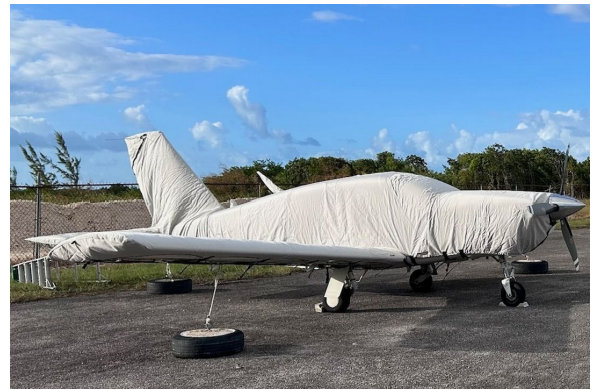
Socata TB-20 Trinidad Complete Cover Set