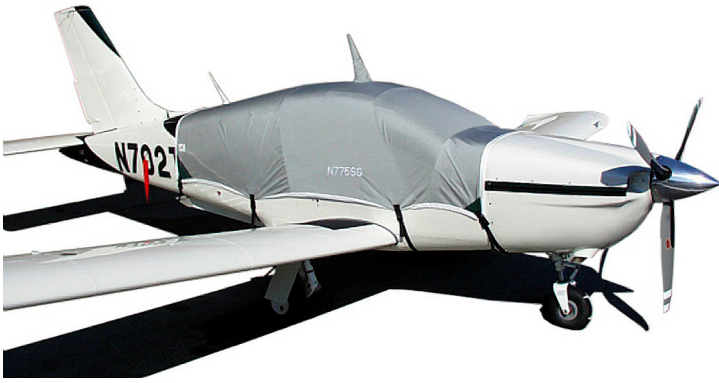
TB20 Standard Canopy Cover