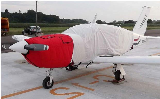
Socata TB-20/21Extended Canopy Cover and Insulated Engine Cover

This cover type is made from Silver Acrylic Sunbrella canvas and is 100% lined with a soft and smooth microfiber. Bruce's Custom Covers developed this material combination especially for aircraft protection. The outer material is medium weight and treated for water resistance, UV resistance and anti-static buildup. The inner lining is a very soft and smooth microfiber to prevent scratching. The material is very reflective, and tests show that the cabin interior temperature can be reduced to near-ambient temperature on the hottest of days. It is water, ice and snow repellent, yet breathable to allow moisture to escape from between the cover and the aircraft surface.