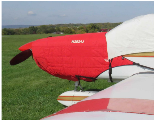
Socata TB10 Insulated Engine Cover

This cover type is made from Silver Acrylic Sunbrella canvas and is 100% lined with a soft and smooth microfiber. Bruce's Custom Covers developed this material combination especially for aircraft protection. The outer material is medium weight and treated for water resistance, UV resistance and anti-static buildup. The inner lining is a very soft and smooth microfiber to prevent scratching. The material is very reflective, and tests show that the cabin interior temperature can be reduced to near-ambient temperature on the hottest of days. It is water, ice and snow repellent, yet breathable to allow moisture to escape from between the cover and the aircraft surface.