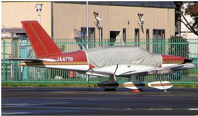
Socata TB-10 Tampico Canopy Cover

This cover type is made from Silver Acrylic Sunbrella canvas and is 100% lined with a soft and smooth microfiber. Bruce's Custom Covers developed this material combination especially for aircraft protection. The outer material is medium weight and treated for water resistance, UV resistance and anti-static buildup. The inner lining is a very soft and smooth microfiber to prevent scratching. The material is very reflective, and tests show that the cabin interior temperature can be reduced to near-ambient temperature on the hottest of days. It is water, ice and snow repellent, yet breathable to allow moisture to escape from between the cover and the aircraft surface.