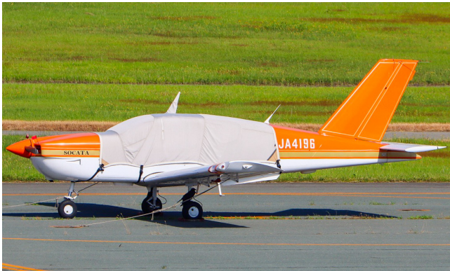
Socata TB-9 Tampico Canopy Cover