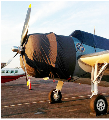
TBM Avenger Engine Cover