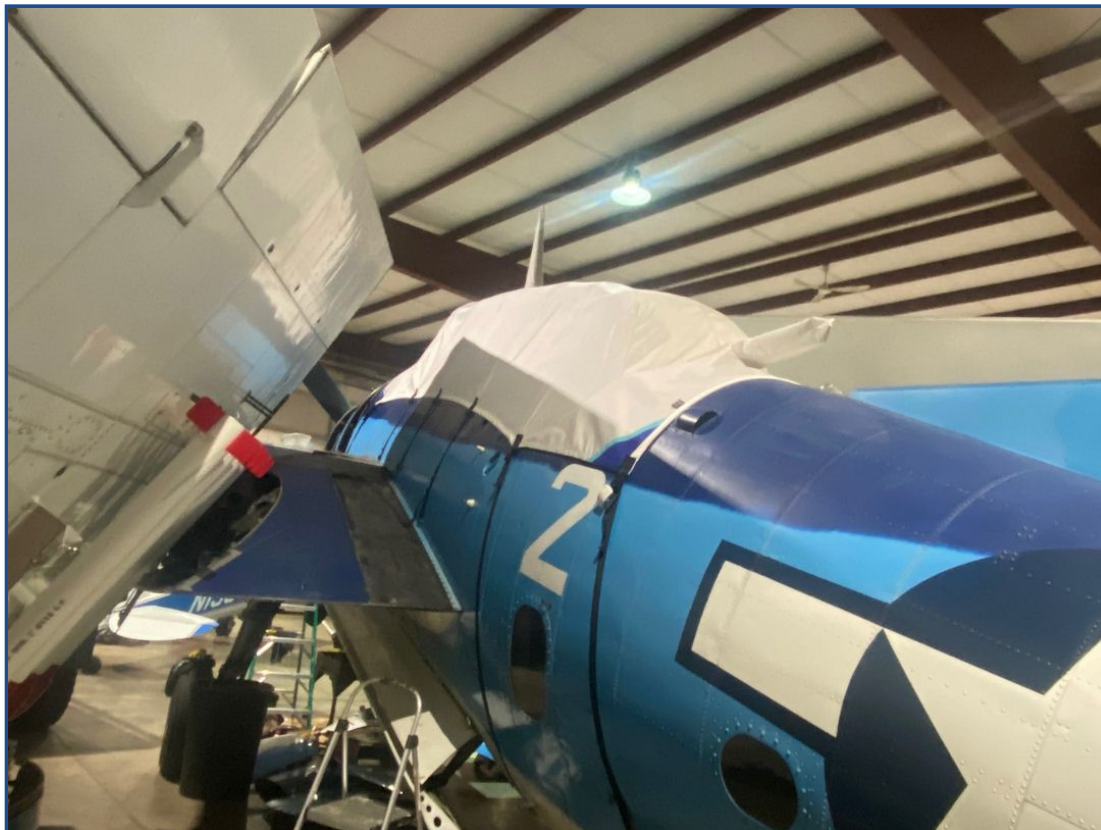
Grumman TBF &amp; TBM Avenger Canopy Cover