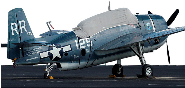
Grumman TBM Avenger Canopy Cover