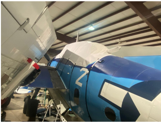
Grumman TBF & TBM Avanger Canopy Cover

the hottest of days. It is water, ice and snow repellent, yet breathable to allow moisture to escape from between the cover and the aircraft surface.