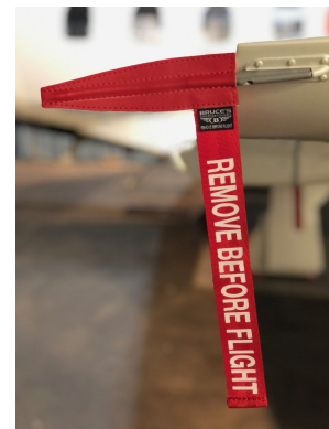
TBM-900 Static Wick Protector