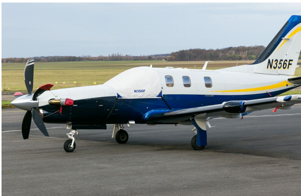
Socata TBM 700 Cockpit Cover (Not Bruce's Prop/Exhaust)

Travel Covers are made with Silver Solution-Dyed Polyester fabric and only lined over the windshield to save weight. The material is lightweight and more compact for easy stowage in the aircraft. The polyester material is water resistant, but only intended for occasional use outside. We also have an ultra lightweight material available for fitted hangar dust covers. For daily outdoor use, the non-travel Sunbrella Cover is the best choice.