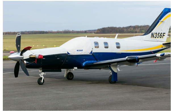
Socata TBM 700 Cockpit Cover (Not Bruce's Prop/Exhaust)