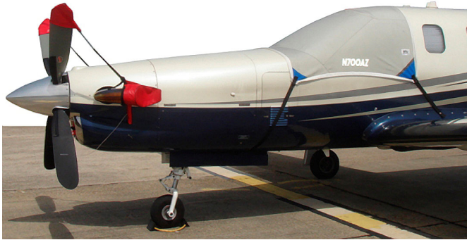
TBM700 Cockpit Cover, Engine Plugs, Prop Tie/Exhaust Covers

This cover type is made from Silver Acrylic Sunbrella canvas and is 100% lined with a soft and smooth microfiber. Bruce's Custom Covers developed this material combination especially for aircraft protection. The outer material is medium weight and treated for water resistance, UV resistance and anti-static buildup. The inner lining is a very soft and smooth microfiber to prevent scratching. The material is very reflective, and tests show that the cabin interior temperature can be reduced to near-ambient temperature on the hottest of days. It is water, ice and snow repellent, yet breathable to allow moisture to escape from between the cover and the aircraft surface.