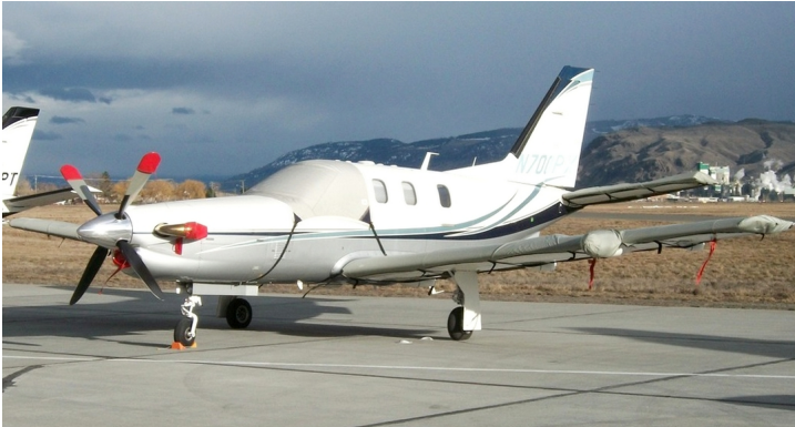
Socata TBM Cockpit, Wings, Horizontal Stab. Covers

Travel Covers are made with Silver Solution-Dyed Polyester fabric and only lined over the windshield to save weight. The material is lightweight and more compact for easy stowage in the aircraft. The polyester material is water resistant, but only intended for occasional use outside. We also have an ultra lightweight material available for fitted hangar dust covers. For daily outdoor use, the non-travel Sunbrella Cover is the best choice.