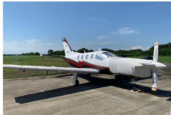
TBM 700 Wing, Engine, Prop Covers