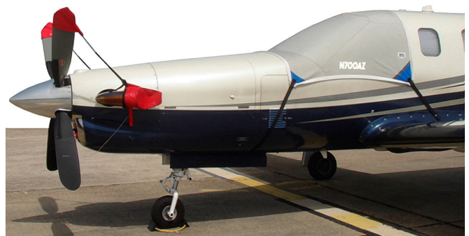
TBM700 Cockpit Cover, Engine Plugs, Prop Tie/Exhaust Covers