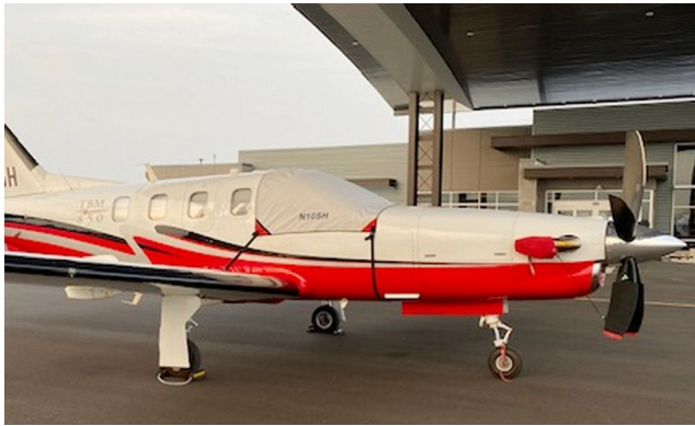
TBM 850 Cockpit Cover (Not Bruce's Prop/Exhaust)

This cover type is made from Silver Acrylic Sunbrella canvas and is 100% lined with a soft and smooth microfiber. Bruce's Custom Covers developed this material combination especially for aircraft protection. The outer material is medium weight and treated for water resistance, UV resistance and anti-static buildup. The inner lining is a very soft and smooth microfiber to prevent scratching. The material is very reflective, and tests show that the cabin interior temperature can be reduced to near-ambient temperature on the hottest of days. It is water, ice and snow repellent, yet breathable to allow moisture to escape from between the cover and the aircraft surface.