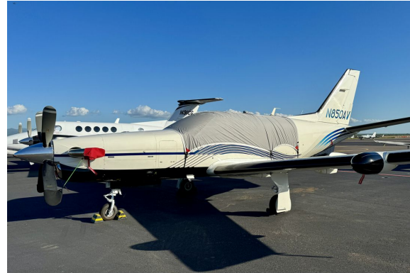
Socata TBM 850 Travel Weight Canopy Cover, Prop Tie/Exhaust Covers