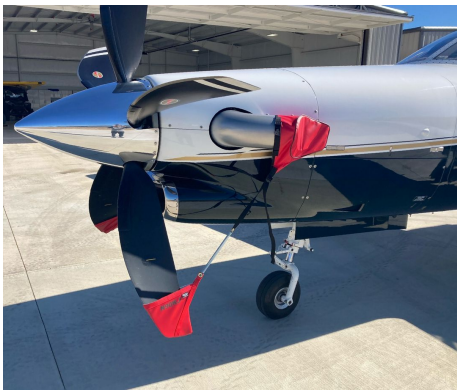
TBM 900 Prop Tie/Exhaust Covers

This cover type is made from Silver Acrylic Sunbrella canvas and is 100% lined with a soft and smooth microfiber. Bruce's Custom Covers developed this material combination especially for aircraft protection. The outer material is medium weight and treated for water resistance, UV resistance and anti-static buildup. The inner lining is a very soft and smooth microfiber to prevent scratching. The material is very reflective, and tests show that the cabin interior temperature can be reduced to near-ambient temperature on the hottest of days. It is water, ice and snow repellent, yet breathable to allow moisture to escape from between the cover and the aircraft surface.