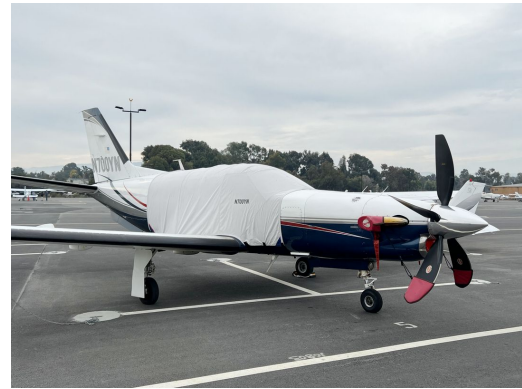
Socata TBM 700 Extended Canopy Cover, Prop Tie/Exhaust Covers