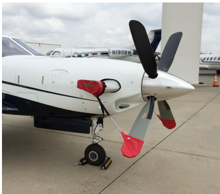
Piper Meridian Prop Tie/Exhaust Cover Set

This cover type is made from Silver Acrylic Sunbrella canvas and is 100% lined with a soft and smooth microfiber. Bruce's Custom Covers developed this material combination especially for aircraft protection. The outer material is medium weight and treated for water resistance, UV resistance and anti-static buildup. The inner lining is a very soft and smooth microfiber to prevent scratching. The material is very reflective, and tests show that the cabin interior temperature can be reduced to near-ambient temperature on the hottest of days. It is water, ice and snow repellent, yet breathable to allow moisture to escape from between the cover and the aircraft surface.