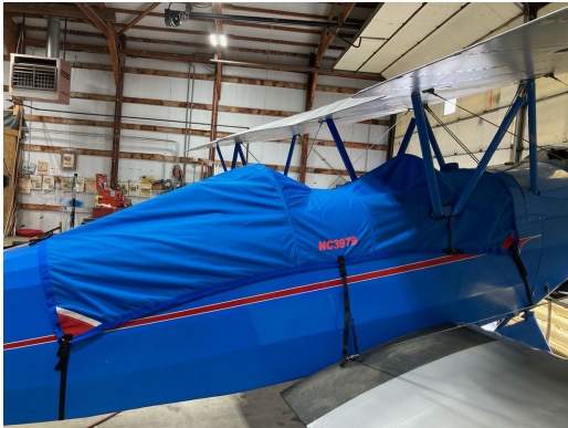
Travel Air 4000 Canopy Cover

Travel Covers are made with Silver Solution-Dyed Polyester fabric and only lined over the windshield to save weight. The material is lightweight and more compact for easy stowage in the aircraft. The polyester material is water resistant, but only intended for occasional use outside. We also have an ultra lightweight material available for fitted hangar dust covers. For daily outdoor use, the non-travel Sunbrella Cover is the best choice.