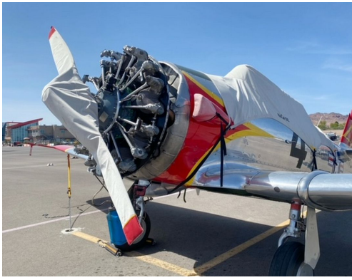
North American T6 Prop Cover