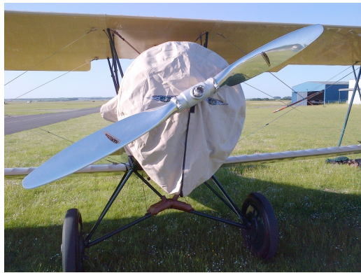
Travelair 4000 Engine Cover

Insulated Covers Material - A special composite material of solution-dyed polyester, 3M Thinsulate insulation, and soft nylon interior fabric. Our insulated covers are designed to complement an engine preheater and help retain heat in the engine compartment after shutdown. If you operate your aircraft in cold-weather, these covers will help prevent engine wear and tear.