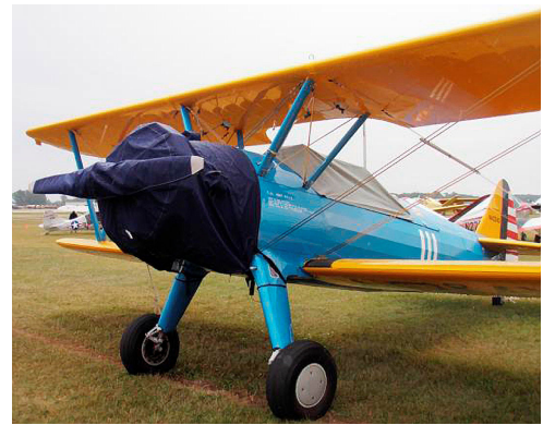
Stearman PT-13 Engine Cover