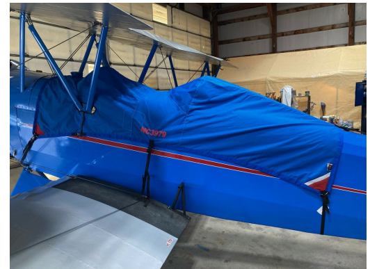
Travel Air 4000 Canopy Cover