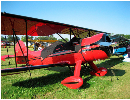
Waco UPF7 Canopy Cover