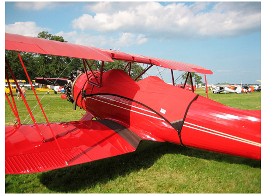
Waco UPF7 Canopy Cover