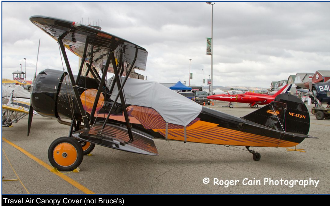
Travel Air Canopy Cover (not Bruce's)