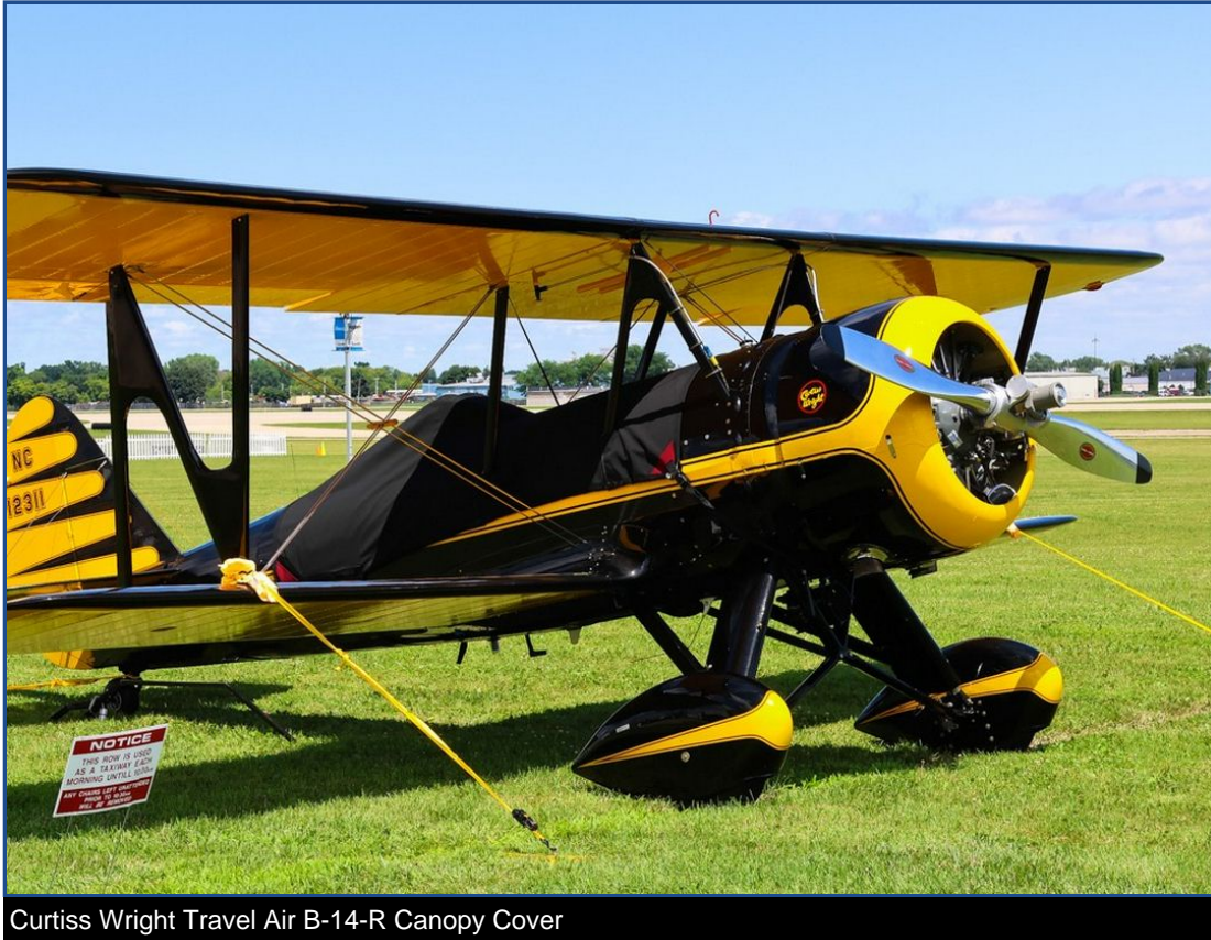
Curtiss Wright Travel Air B-14-R Canopy Cover