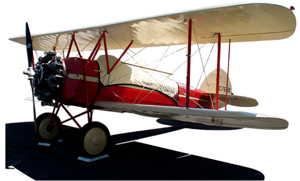
Waco 10 Canopy Cover