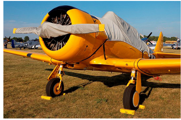
North American T6 Canopy Cover and Prop Cover