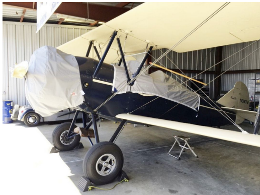
Travelair 4000 Canopy & Engine Covers, light weight travel type

Travel Covers are made with Silver Solution-Dyed Polyester fabric and only lined over the windshield to save weight. The material is lightweight and more compact for easy stowage in the aircraft. The polyester material is water resistant, but only intended for occasional use outside. We also have an ultra lightweight material available for fitted hangar dust covers. For daily outdoor use, the non-travel Sunbrella Cover is the best choice.