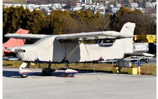
Tecnam P92 Echo Complete Cover Set