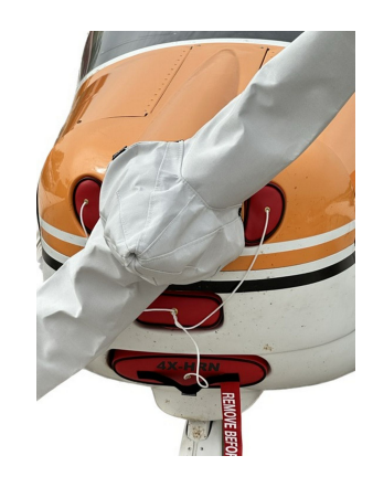
Tecnam P2002 Sierra Engine Plug Set

Engine Inlet Plugs are custom fit for your Tecnam P2002 Sierra, P96 Golf, P-Mentor intakes, made with heavy-duty vinyl material, and stuffed with a single block of sculpted urethane foam. Each plug has a zipper that allows the foam to be removed and dried if necessary. Engine plugs have warning flags that are visible from the cockpit or 'remove before flight' streamers sewn onto the face of the plugs. Most plugs are imprinted with the aircraft registration number in black for an extra charge. Storage bag NOT included. Engine plugs may be inserted after flight when the engine is still warm. Engine Inlet Plugs are commonly referred to as Cowl Plugs, Intake Plugs, Cowl Blocks, Engine Blocks, and Engine Bungs.