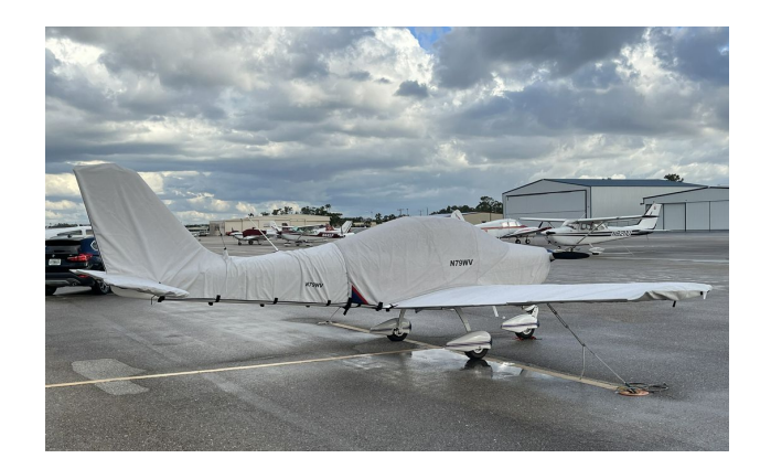
Tecnam P2002 Sierra Complete Cover Set