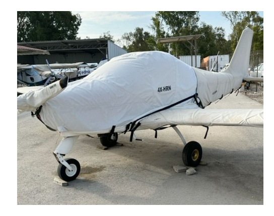
Tecnam Sierra Complete Cover Set

This cover type is made from Silver Acrylic Sunbrella canvas and is 100% lined with a soft and smooth microfiber. Bruce's Custom Covers developed this material combination especially for aircraft protection. The outer material is medium weight and treated for water resistance, UV resistance and anti-static buildup. The inner lining is a very soft and smooth microfiber to prevent scratching. The material is very reflective, and tests show that the cabin interior temperature can be reduced to near-ambient temperature on the hottest of days. It is water, ice and snow repellent, yet breathable to allow moisture to escape from between the cover and the aircraft surface.