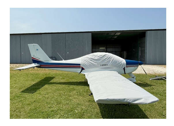
Tecnam P2002 Sierra Canopy, Wing & Horizontal Stabilizer Covers