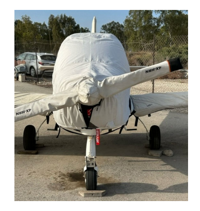
Tecnam Sierra Complete Cover Set