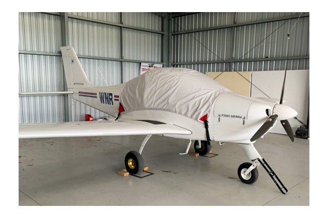
Tecnam P2002 Sierra Canopy Cover

This cover type is made from Silver Acrylic Sunbrella canvas and is 100% lined with a soft and smooth microfiber. Bruce's Custom Covers developed this material combination especially for aircraft protection. The outer material is medium weight and treated for water resistance, UV resistance and anti-static buildup. The inner lining is a very soft and smooth microfiber to prevent scratching. The material is very reflective, and tests show that the cabin interior temperature can be reduced to near-ambient temperature on the hottest of days. It is water, ice and snow repellent, yet breathable to allow moisture to escape from between the cover and the aircraft surface.