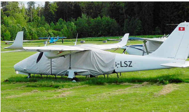
Tecnam Twin Extended Canopy/Nose Cover

This cover type is made from Silver Acrylic Sunbrella canvas and is 100% lined with a soft and smooth microfiber. Bruce's Custom Covers developed this material combination especially for aircraft protection. The outer material is medium weight and treated for water resistance, UV resistance and anti-static buildup. The inner lining is a very soft and smooth microfiber to prevent scratching. The material is very reflective, and tests show that the cabin interior temperature can be reduced to near-ambient temperature on the hottest of days. It is water, ice and snow repellent, yet breathable to allow moisture to escape from between the cover and the aircraft surface.