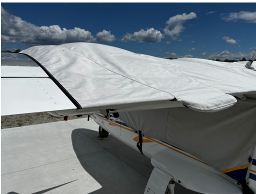
Tecnam P2006T Twin Wing & Engine Covers, All Year Use

WINTER USE MATERIAL - Made with Solution-Dyed Polyester fabric, this option is intended for seasonal use to aid in deicing, rain mitigation, or for occasional travel. The material is lighter and more compact, but more susceptible to UV damage and may have a shorter useful life if used continuously outside than the all-year use material.