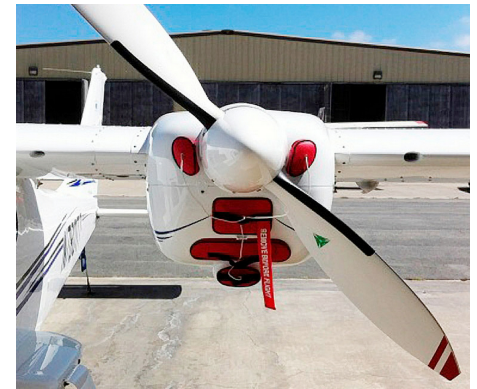
ENGINE PLUGS PREVENT BIRD NEST FOD. Piper Saratoga Engine Cowling Bird's Nest Tecnam P2006T Engine Plugs