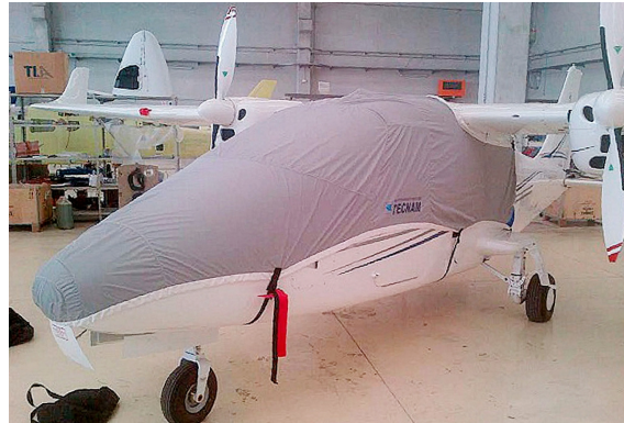
Tecnam P2006T Twin Lightweight Travel Canopy/Nose Cover

Travel Covers are made with Silver Solution-Dyed Polyester fabric and only lined over the windshield to save weight. The material is lightweight and more compact for easy stowage in the aircraft. The polyester material is water resistant, but only intended for occasional use outside. We also have an ultra lightweight material available for fitted hangar dust covers. For daily outdoor use, the non-travel Sunbrella Cover is the best choice.