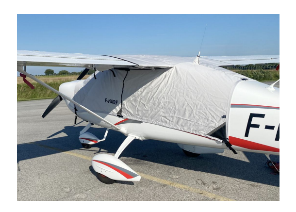
Tecnam P2010 Over-Top Canopy Cover