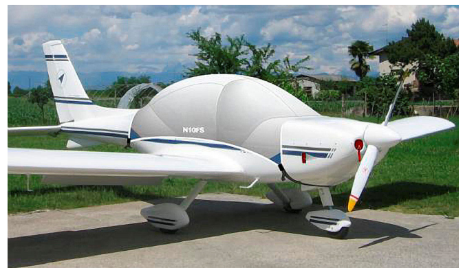
Texan Canopy Cover & Engine Plugs (Illustration)