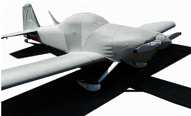
Van's RV-4 Complete Cover

This cover type is made from Silver Acrylic Sunbrella canvas and is 100% lined with a soft and smooth microfiber. Bruce's Custom Covers developed this material combination especially for aircraft protection. The outer material is medium weight and treated for water resistance, UV resistance and anti-static buildup. The inner lining is a very soft and smooth microfiber to prevent scratching. The material is very reflective, and tests show that the cabin interior temperature can be reduced to near-ambient temperature on the hottest of days. It is water, ice and snow repellent, yet breathable to allow moisture to escape from between the cover and the aircraft surface.