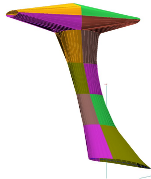
Autogyro Calidus Rotor Mast Cover, 3D model