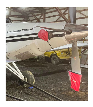
Ayres Thrush Prop Tie/Exhaust Covers