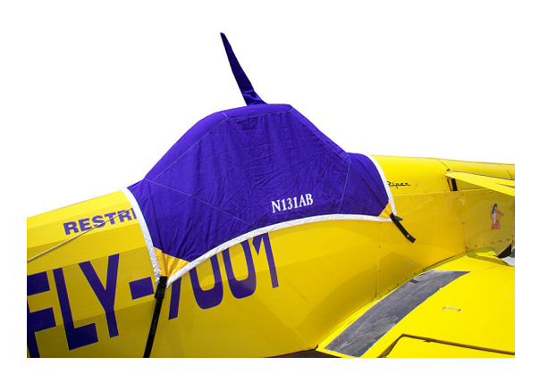
Piper Pawnee Canopy Cover