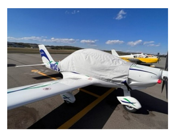
TL 2000 Sting Travel Weight Canopy Cover

This cover type is made from Silver Acrylic Sunbrella canvas and is 100% lined with a soft and smooth microfiber. Bruce's Custom Covers developed this material combination especially for aircraft protection. The outer material is medium weight and treated for water resistance, UV resistance and anti-static buildup. The inner lining is a very soft and smooth microfiber to prevent scratching. The material is very reflective, and tests show that the cabin interior temperature can be reduced to near-ambient temperature on the hottest of days. It is water, ice and snow repellent, yet breathable to allow moisture to escape from between the cover and the aircraft surface.