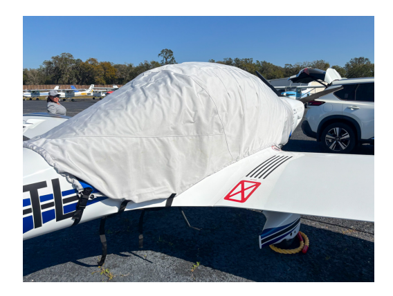
TL Ultralight TL 2000 Sting Sport, 96 Star, S3, S4 Canopy Cover