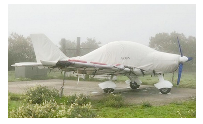
TL Sting Sport Full Cover Set

WINTER USE MATERIAL - Made with Solution-Dyed Polyester fabric, this option is intended for seasonal use to aid in deicing, rain mitigation, or for occasional travel. The material is lighter and more compact, but more susceptible to UV damage and may have a shorter useful life if used continuously outside than the all-year use material.