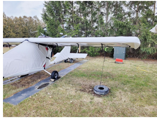
Titan Tornado Canopy/Nose, Wings & Empennage Cover