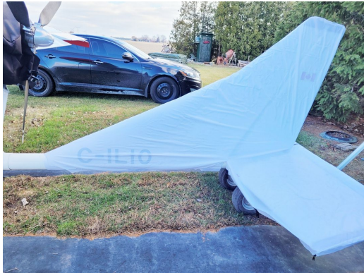
Titan Tornado Empennage Cover, test fit cover