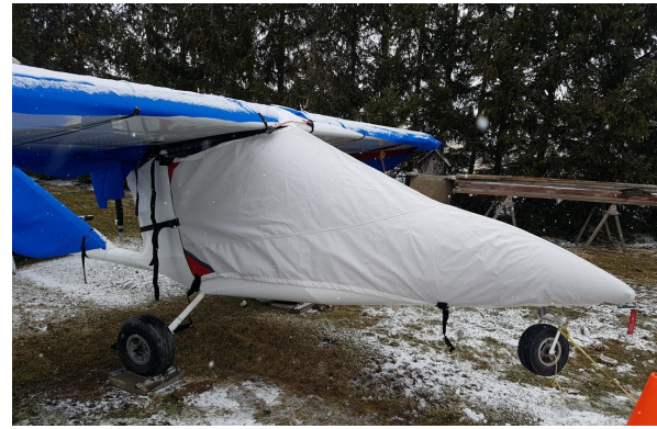
Titan Tornado Canopy/Nose Cover