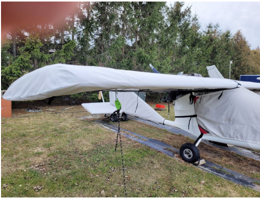
Titan Tornado Canopy/Nose, Wings & Empennage Cover