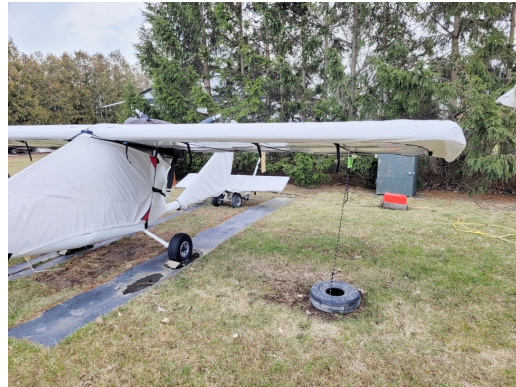
Titan Tornado Canopy/Nose, Wings & Empennage Cover