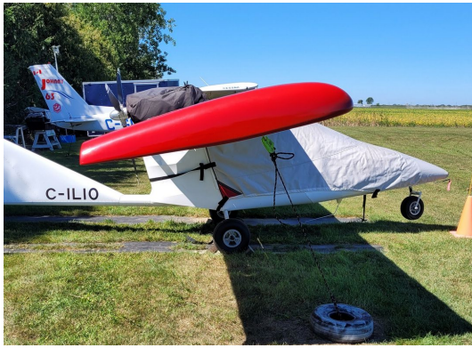
Titan Tornado Canopy/Nose Cover