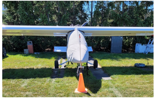
Titan Tornado Canopy/Nose Cover