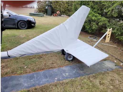
Titan Tornado Empennage Cover

WINTER USE MATERIAL - Made with Solution-Dyed Polyester fabric, this option is intended for seasonal use to aid in deicing, rain mitigation, or for occasional travel. The material is lighter and more compact, but more susceptible to UV damage and may have a shorter useful life if used continuously outside than the all-year use material.