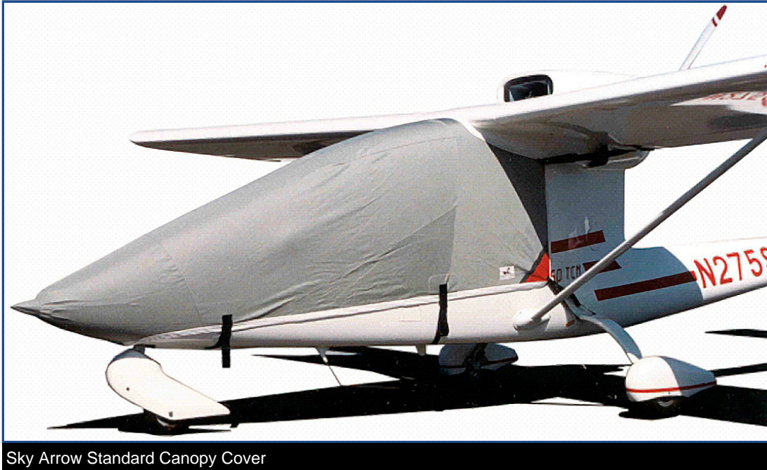
Sky Arrow Standard Canopy Cover