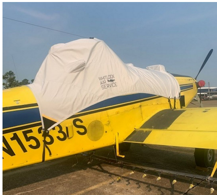
Air Tractor AT-402 Canopy/Hopper Cover

This cover type is made from Silver Acrylic Sunbrella canvas and is 100% lined with a soft and smooth microfiber. Bruce's Custom Covers developed this material combination especially for aircraft protection. The outer material is medium weight and treated for water resistance, UV resistance and anti-static buildup. The inner lining is a very soft and smooth microfiber to prevent scratching. The material is very reflective, and tests show that the cabin interior temperature can be reduced to near-ambient temperature on the hottest of days. It is water, ice and snow repellent, yet breathable to allow moisture to escape from between the cover and the aircraft surface.