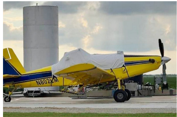
Air Tractor Inc AT-802A Canopy/Hopper Cover