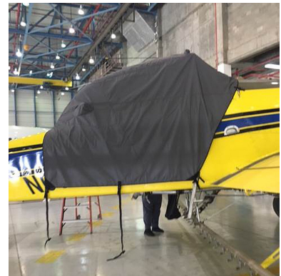
Air Tractor AT-802F Canopy Cover