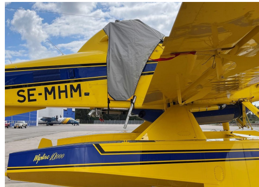
Air Tractor Light Weight Canopy Cover