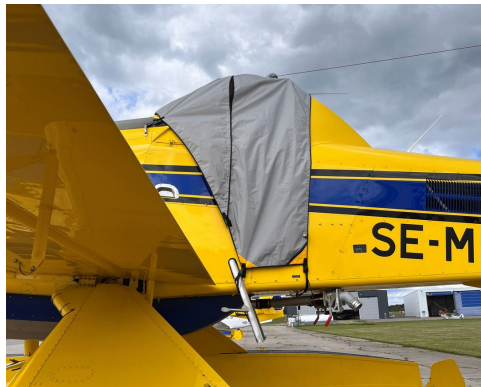
Air Tractor Light Weight Canopy Cover

Travel Covers are made with Silver Solution-Dyed Polyester fabric and only lined over the windshield to save weight. The material is lightweight and more compact for easy stowage in the aircraft. The polyester material is water resistant, but only intended for occasional use outside. We also have an ultra lightweight material available for fitted hangar dust covers. For daily outdoor use, the non-travel Sunbrella Cover is the best choice.