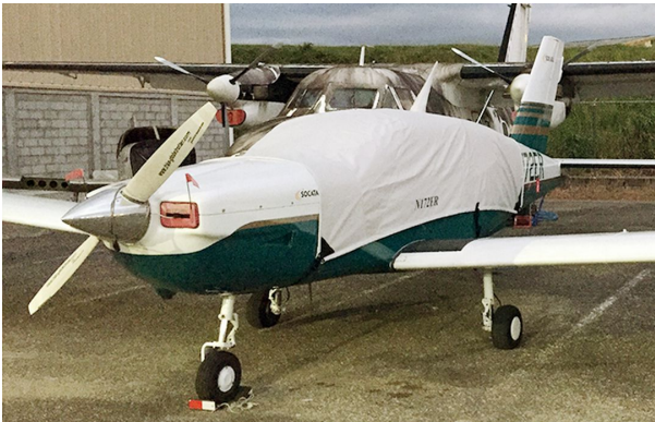
Socata TB-9 Tampico Canopy Cover and Engine Inlet Plugs