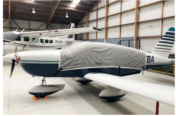
Socata TB-9 TRAVEL COVER, Light Weight Canopy Cover