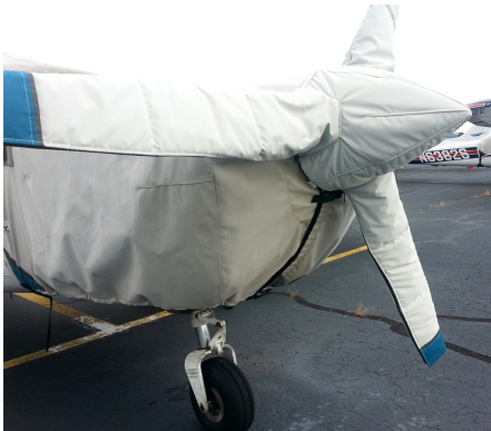
Socata Trinidad/Tobago Engine & Prop Covers

This cover type is made from Silver Acrylic Sunbrella canvas and is 100% lined with a soft and smooth microfiber. Bruce's Custom Covers developed this material combination especially for aircraft protection. The outer material is medium weight and treated for water resistance, UV resistance and anti-static buildup. The inner lining is a very soft and smooth microfiber to prevent scratching. The material is very reflective, and tests show that the cabin interior temperature can be reduced to near-ambient temperature on the hottest of days. It is water, ice and snow repellent, yet breathable to allow moisture to escape from between the cover and the aircraft surface.