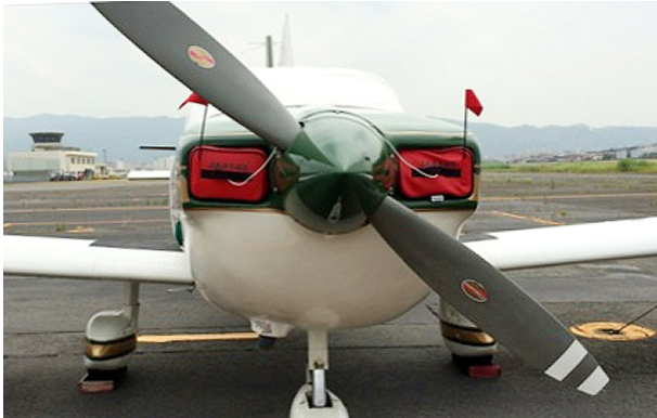
Socata TB-20 Engine Plugs

Engine Inlet Plugs are custom fit for your Socata Tampico, Tobago & Trinidad intakes, made with heavy-duty vinyl material, and stuffed with a single block of sculpted urethane foam. Each plug has a zipper that allows the foam to be removed and dried if necessary. Engine plugs have warning flags that are visible from the cockpit or 'remove before flight' streamers sewn onto the face of the plugs. Most plugs are imprinted with the aircraft registration number in black for an extra charge. Storage bag NOT included. Engine plugs may be inserted after flight when the engine is still warm. Engine Inlet Plugs are commonly referred to as Cowl Plugs, Intake Plugs, Cowl Blocks, Engine Blocks, and Engine Bungs.