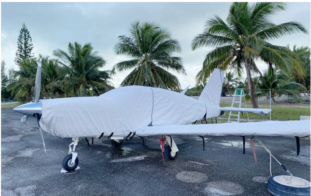
Socata Trinidad Full Cover Set