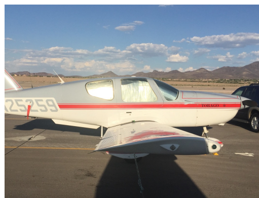
Socata TB-10 Cabin HeatShields