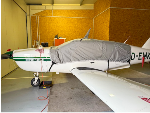
Trinidad TB20 Travel Cover, Light Weight Canopy Cover

Travel Covers are made with Silver Solution-Dyed Polyester fabric and only lined over the windshield to save weight. The material is lightweight and more compact for easy stowage in the aircraft. The polyester material is water resistant, but only intended for occasional use outside. We also have an ultra lightweight material available for fitted hangar dust covers. For daily outdoor use, the non-travel Sunbrella Cover is the best choice.