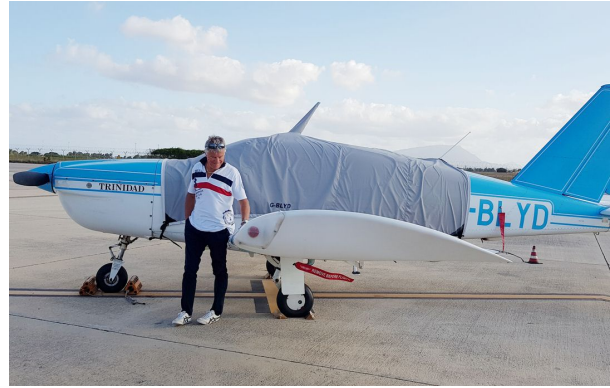
Socata Tampico, Tobago & Trinidad Travel Cover, Light Weight Canopy Cover