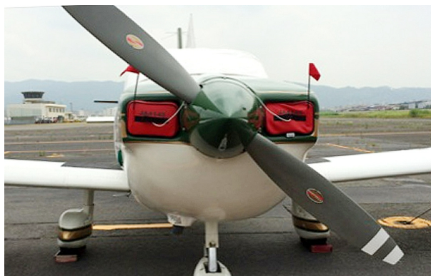
Socata TB-20 Engine Plugs