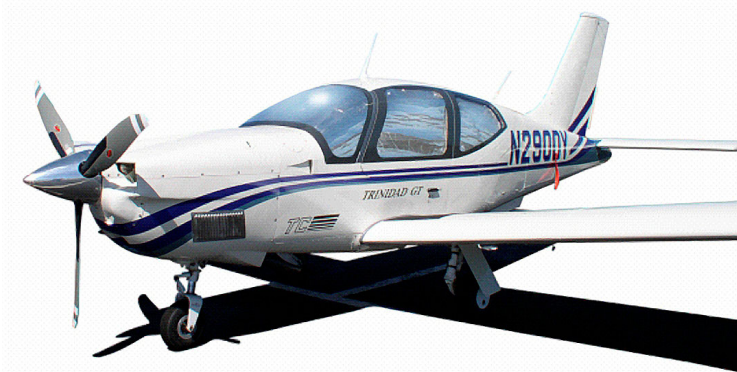
Socata TB20 HeatShields

Windshield Heatshields are interior sunshades for an aircraft's front windshield. The product is a unique composite of closed-cell foam with a silver mylar finish. The semi-rigid design is stiff enough to stand along the inside of the windshield using sun visors or window framing. It folds up flat and easily stores in the included storage sleeve. Some designs may require velcro and suction cups or split right and left sides. A Heatshield is an excellent short-term remedy for cockpit overheating. An external fabric cover is far more effective and practical for long-term protection.