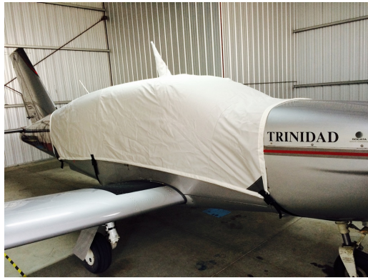
Trinidad Canopy Cover

This cover type is made from Silver Acrylic Sunbrella canvas and is 100% lined with a soft and smooth microfiber. Bruce's Custom Covers developed this material combination especially for aircraft protection. The outer material is medium weight and treated for water resistance, UV resistance and anti-static buildup. The inner lining is a very soft and smooth microfiber to prevent scratching. The material is very reflective, and tests show that the cabin interior temperature can be reduced to near-ambient temperature on the hottest of days. It is water, ice and snow repellent, yet breathable to allow moisture to escape from between the cover and the aircraft surface.