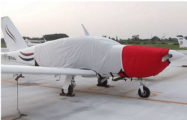
Socata TB-20/21Extended Canopy Cover and Insulated Engine Cover