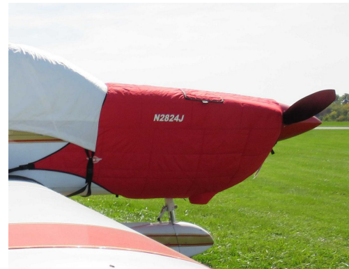
Socata TB-10 Insulated Engine Cover