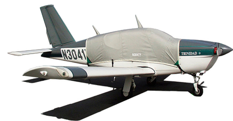
Trinidad/Tobago Standard Canopy Cover & Engine Plugs

This cover type is made from Silver Acrylic Sunbrella canvas and is 100% lined with a soft and smooth microfiber. Bruce's Custom Covers developed this material combination especially for aircraft protection. The outer material is medium weight and treated for water resistance, UV resistance and anti-static buildup. The inner lining is a very soft and smooth microfiber to prevent scratching. The material is very reflective, and tests show that the cabin interior temperature can be reduced to near-ambient temperature on the hottest of days. It is water, ice and snow repellent, yet breathable to allow moisture to escape from between the cover and the aircraft surface.