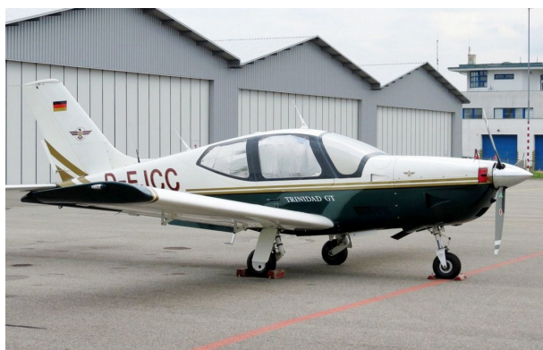
Socata Tobago TB20 Heatshields

Windshield Heatshields are interior sunshades for an aircraft's front windshield. The product is a unique composite of closed-cell foam with a silver mylar finish. The semi-rigid design is stiff enough to stand along the inside of the windshield using sun visors or window framing. It folds up flat and easily stores in the included storage sleeve. Some designs may require velcro and suction cups or split right and left sides. A Heatshield is an excellent short-term remedy for cockpit overheating. An external fabric cover is far more effective and practical for long-term protection.