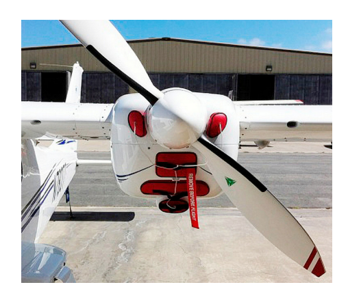
Tecnam P2006T Engine Plugs

Engine Inlet Plugs are custom fit for your Tecnam P2012 Traveller intakes, made with heavy-duty vinyl material, and stuffed with a single block of sculpted urethane foam. Each plug has a zipper that allows the foam to be removed and dried if necessary. Engine plugs have warning flags that are visible from the cockpit or 'remove before flight' streamers sewn onto the face of the plugs. Most plugs are imprinted with the aircraft registration number in black for an extra charge. Storage bag NOT included. Engine plugs may be inserted after flight when the engine is still warm. Engine Inlet Plugs are commonly referred to as Cowl Plugs, Intake Plugs, Cowl Blocks, Engine Blocks, and Engine Bungs.