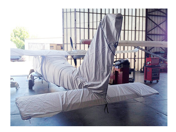
Tecnam Twin Wing/Engine Covers