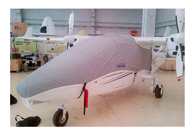
Tecnam P2006T Twin Lightweight Travel Canopy/Nose Cover

Travel Covers are made with Silver Solution-Dyed Polyester fabric and only lined over the windshield to save weight. The material is lightweight and more compact for easy stowage in the aircraft. The polyester material is water resistant, but only intended for occasional use outside. We also have an ultra lightweight material available for fitted hangar dust covers. For daily outdoor use, the non-travel Sunbrella Cover is the best choice.