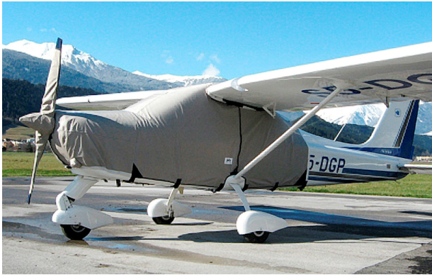
Tecnam Echo Extended Canopy, Engine, Prop Covers

the hottest of days. It is water, ice and snow repellent, yet breathable to allow moisture to escape from between the cover and the aircraft surface.