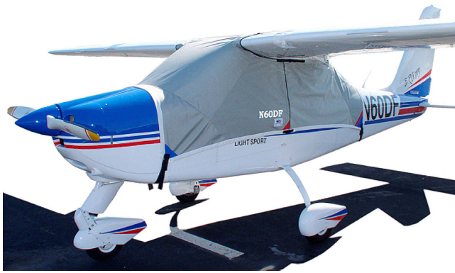
Tecnam Bravo Canopy Cover