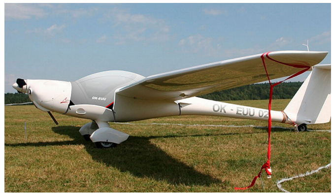
Lambda Canopy Cover (illustration)