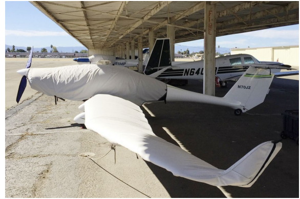
Phoenix Air U-15 Canopy/Engine, Wing & Horizontal Stabilizer Covers