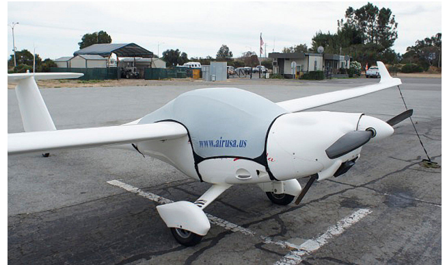
Lambda Travel Canopy Cover