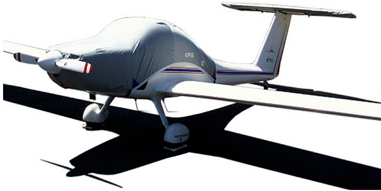
Grob 109 Canopy/Engine Cover & Horiz. Stabilizer Cover

WINTER USE MATERIAL - Made with Solution-Dyed Polyester fabric, this option is intended for seasonal use to aid in deicing, rain mitigation, or for occasional travel. The material is lighter and more compact, but more susceptible to UV damage and may have a shorter useful life if used continuously outside than the all-year use material.