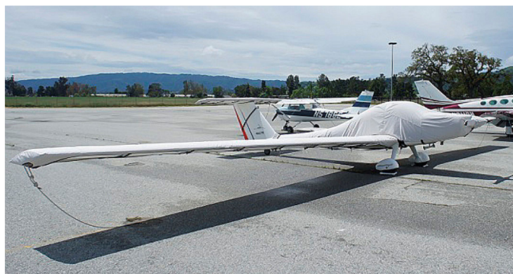
Grob 109 Canopy/Engine w/ extension to tail, Wing, Stabilizer & Prop/Spinner Covers