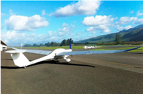
Lambda Canopy/Engine Cover and Wing Covers