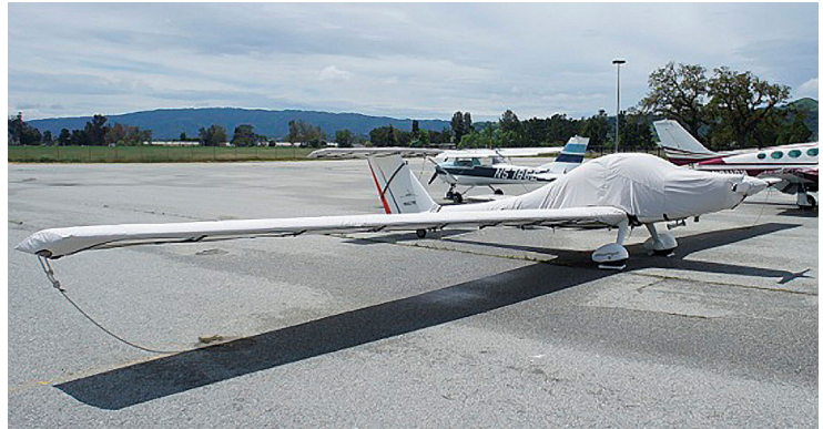
Lambda Canopy/Engine Cover and Wing Covers Grob 109 Canopy/Engine w/ extension to tail, Wing, Stabilizer & Prop/Spinner Covers