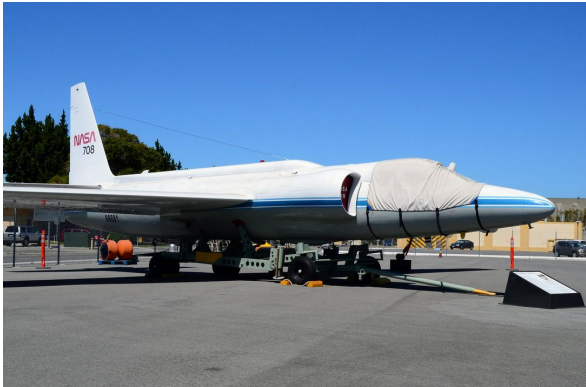
Lockheed U-2 Cockpit Cover