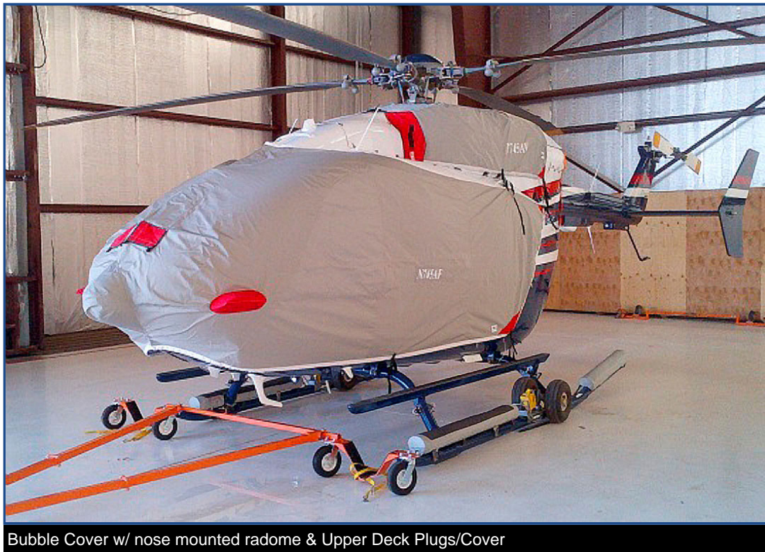
Bubble Cover w/ nose mounted radome &amp; Upper Deck Plugs/Cover