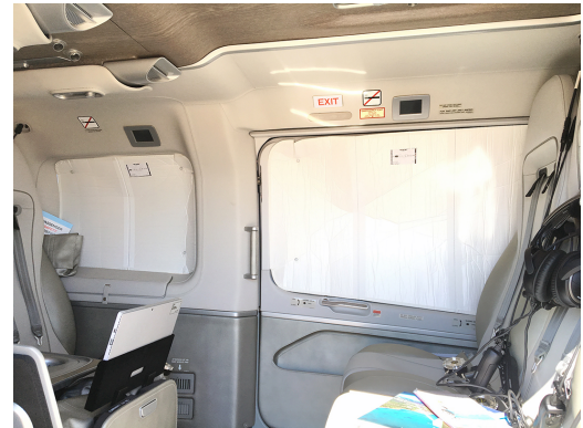
Eurocopter EC-145 Cabin Heatshields