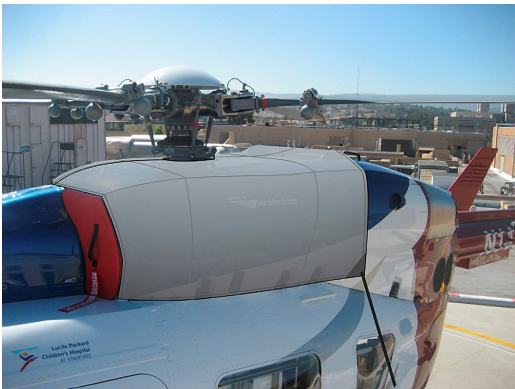
Bubble Cover w/ nose mounted radome, Upper Deck Plugs/Cover Upper Deck Plugs/Cover, extended to cover aft intake vents