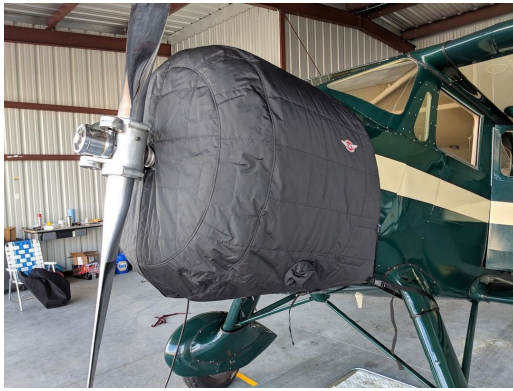
Wacon Cabin Biplane ZQC-6 Insulated Engine Cover