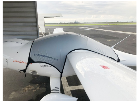
SUNDANCER Travel Cover with custom Imprint