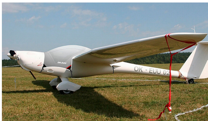
Lambda Canopy Cover (illustration)