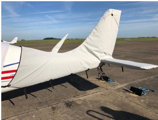
Tecnam P2008 Empennage Cover (Tailboom, Vertical & Horizontal Stabilizers), All Year Use

WINTER USE MATERIAL - Made with Solution-Dyed Polyester fabric, this option is intended for seasonal use to aid in deicing, rain mitigation, or for occasional travel. The material is lighter and more compact, but more susceptible to UV damage and may have a shorter useful life if used continuously outside than the all-year use material.