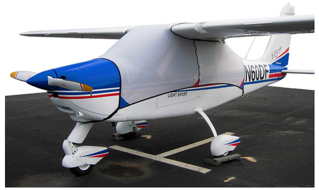
Tecnam Bravo Spandex FlyAway Travel Canopy Cover