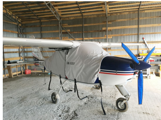
Tecnam P2004 Bravo Extended Canopy Cover, Over-Top Type