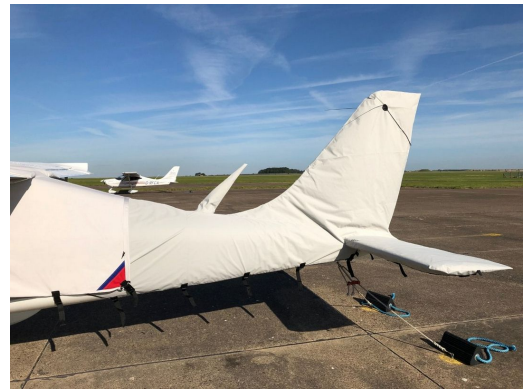
Tecnam P2008 Empennage Cover (Tailboom, Vertical & Horizontal Stabilizers), All Year Use