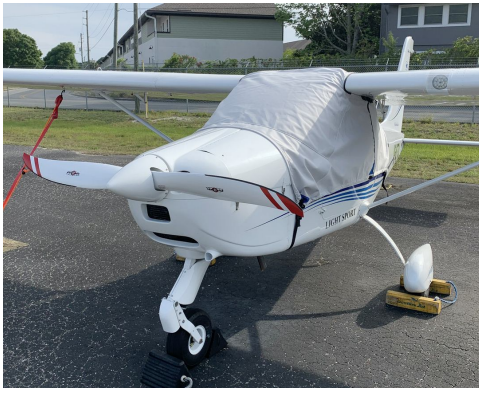
Tecnam P92 EAGLET Canopy Cover Over theTop Style