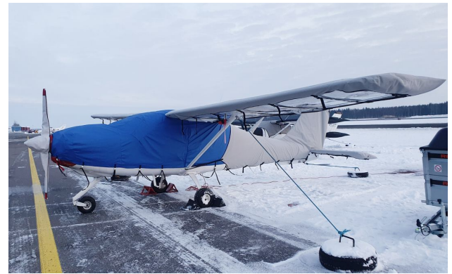
Tecnam P2010 Wing, Empennage & Prop Covers