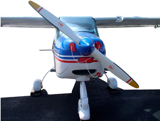
Tecnam Bravo Engine Plugs

Engine Inlet Plugs are custom fit for your Vulcanair V1.0 intakes, made with heavy-duty vinyl material, and stuffed with a single block of sculpted urethane foam. Each plug has a zipper that allows the foam to be removed and dried if necessary. Engine plugs have warning flags that are visible from the cockpit or 'remove before flight' streamers sewn onto the face of the plugs. Most plugs are imprinted with the aircraft registration number in black for an extra charge. Storage bag NOT included. Engine plugs may be inserted after flight when the engine is still warm. Engine Inlet Plugs are commonly referred to as Cowl Plugs, Intake Plugs, Cowl Blocks, Engine Blocks, and Engine Bungs.