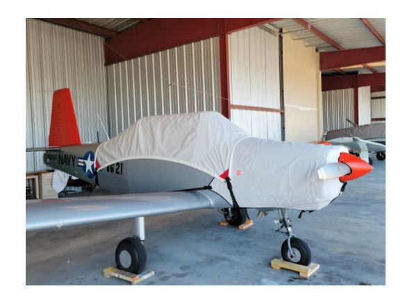
Varga Kachina Canopy & Engine Covers

This cover type is made from Silver Acrylic Sunbrella canvas and is 100% lined with a soft and smooth microfiber. Bruce's Custom Covers developed this material combination especially for aircraft protection. The outer material is medium weight and treated for water resistance, UV resistance and anti-static buildup. The inner lining is a very soft and smooth microfiber to prevent scratching. The material is very reflective, and tests show that the cabin interior temperature can be reduced to near-ambient temperature on the hottest of days. It is water, ice and snow repellent, yet breathable to allow moisture to escape from between the cover and the aircraft surface.