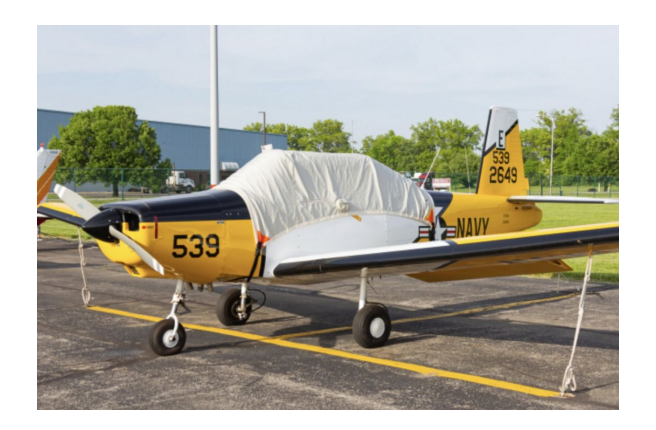
Varga Kachina Canopy Cover