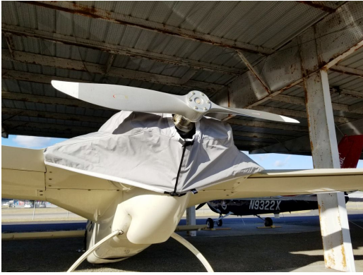
Rutan Vari EZ Travel Cover/Nose/Engine Cover