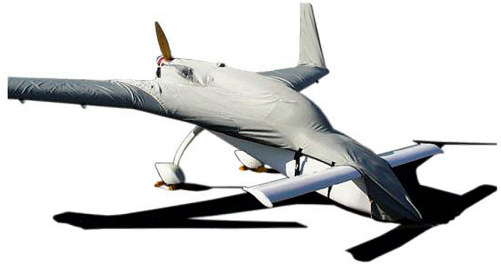
Long-EZ Canopy/Engine and Wing Covers