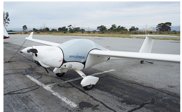
Lambda Canopy Cover