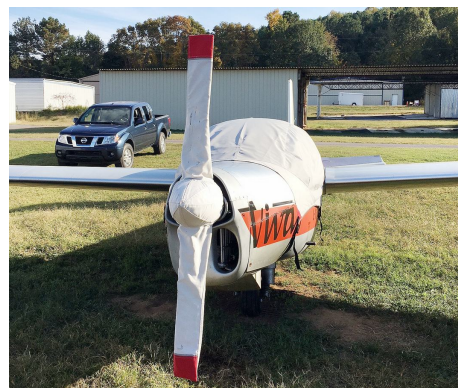
Aerotechnik L-13 Vivat Motorglider Prop/Spinner & Canopy Covers