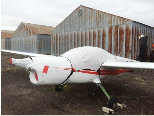
Vivat Canopy and Prop/Spinner Cover