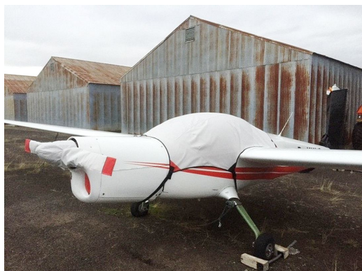
Vivat Canopy and Prop/Spinner Cover