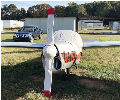
Aerotechnik L-13 Vivat Motorglider Prop/Spinner & Canopy Covers