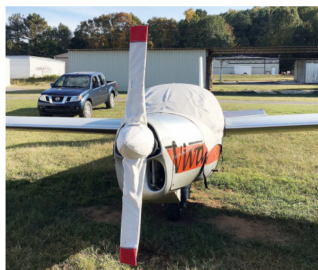
Aerotechnik L-13 Vivat Motorglider Prop/Spinner & Canopy Covers