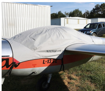
Aerotechnik L-13 Travel Cover