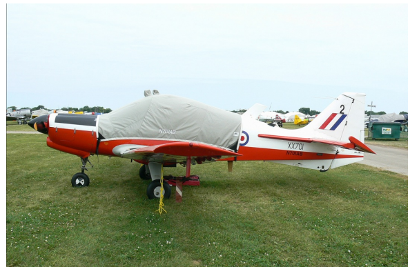
Scottish Aviation Bulldog Canopy Cover