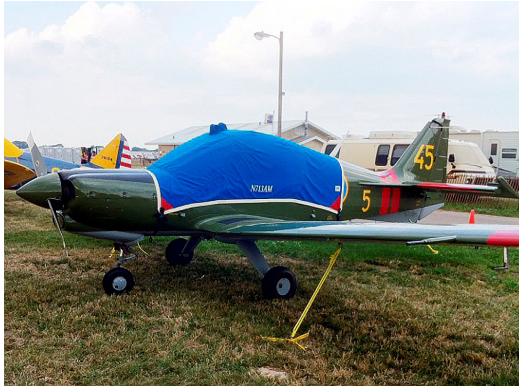
Scottish Aviation Bulldog Canopy Cover

This cover type is made from Silver Acrylic Sunbrella canvas and is 100% lined with a soft and smooth microfiber. Bruce's Custom Covers developed this material combination especially for aircraft protection. The outer material is medium weight and treated for water resistance, UV resistance and anti-static buildup. The inner lining is a very soft and smooth microfiber to prevent scratching. The material is very reflective, and tests show that the cabin interior temperature can be reduced to near-ambient temperature on the hottest of days. It is water, ice and snow repellent, yet breathable to allow moisture to escape from between the cover and the aircraft surface.