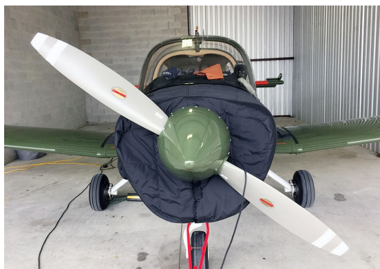
Scottish Aviation Bulldog Insulated Engine Cover