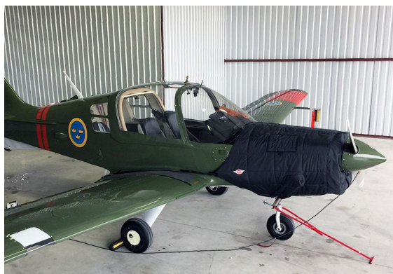
Scottish Aviation Bulldog Insulated Engine Cover

This cover type is made from Silver Acrylic Sunbrella canvas and is 100% lined with a soft and smooth microfiber. Bruce's Custom Covers developed this material combination especially for aircraft protection. The outer material is medium weight and treated for water resistance, UV resistance and anti-static buildup. The inner lining is a very soft and smooth microfiber to prevent scratching. The material is very reflective, and tests show that the cabin interior temperature can be reduced to near-ambient temperature on the hottest of days. It is water, ice and snow repellent, yet breathable to allow moisture to escape from between the cover and the aircraft surface.