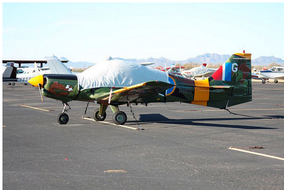
Scottish Aviation Bulldog Canopy Cover

Travel Covers are made with Silver Solution-Dyed Polyester fabric and only lined over the windshield to save weight. The material is lightweight and more compact for easy stowage in the aircraft. The polyester material is water resistant, but only intended for occasional use outside. We also have an ultra lightweight material available for fitted hangar dust covers. For daily outdoor use, the non-travel Sunbrella Cover is the best choice.