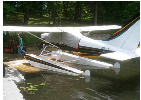
Glastar Sportsman Canopy Cover