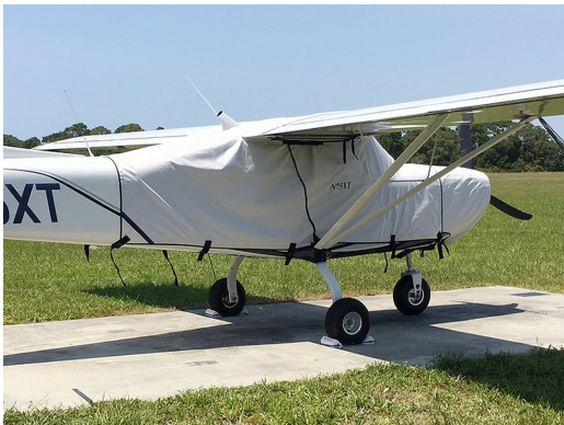
World Aircraft Extended Canopy Cover & Engine Cover

This cover type is made from Silver Acrylic Sunbrella canvas and is 100% lined with a soft and smooth microfiber. Bruce's Custom Covers developed this material combination especially for aircraft protection. The outer material is medium weight and treated for water resistance, UV resistance and anti-static buildup. The inner lining is a very soft and smooth microfiber to prevent scratching. The material is very reflective, and tests show that the cabin interior temperature can be reduced to near-ambient temperature on the hottest of days. It is water, ice and snow repellent, yet breathable to allow moisture to escape from between the cover and the aircraft surface.