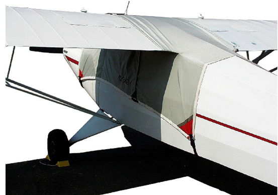
Piper PA-12 Super Cruiser Over-Top Canopy Cover