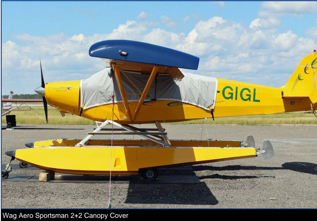
Wag Aero Sportsman 2+2 Canopy Cover