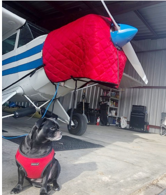
Piper PA-12 Insulated Hangar Blanket

This cover type is made from Silver Acrylic Sunbrella canvas and is 100% lined with a soft and smooth microfiber. Bruce's Custom Covers developed this material combination especially for aircraft protection. The outer material is medium weight and treated for water resistance, UV resistance and anti-static buildup. The inner lining is a very soft and smooth microfiber to prevent scratching. The material is very reflective, and tests show that the cabin interior temperature can be reduced to near-ambient temperature on the hottest of days. It is water, ice and snow repellent, yet breathable to allow moisture to escape from between the cover and the aircraft surface.