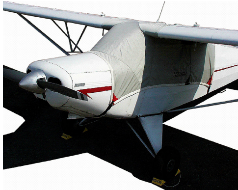
Piper PA-12 Super Cruiser Over-Top Canopy Cover

This cover type is made from Silver Acrylic Sunbrella canvas and is 100% lined with a soft and smooth microfiber. Bruce's Custom Covers developed this material combination especially for aircraft protection. The outer material is medium weight and treated for water resistance, UV resistance and anti-static buildup. The inner lining is a very soft and smooth microfiber to prevent scratching. The material is very reflective, and tests show that the cabin interior temperature can be reduced to near-ambient temperature on the hottest of days. It is water, ice and snow repellent, yet breathable to allow moisture to escape from between the cover and the aircraft surface.