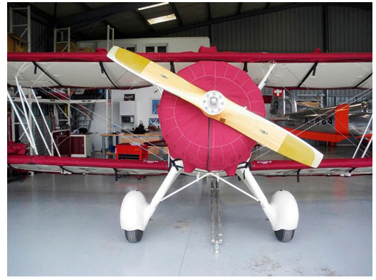
Waco UPF-7 Engine Cover