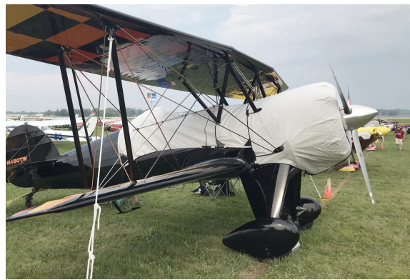
Waco Taperwing Cockpit & Engine Covers