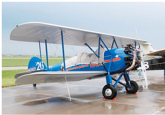
Waco ASO Canopy Cover