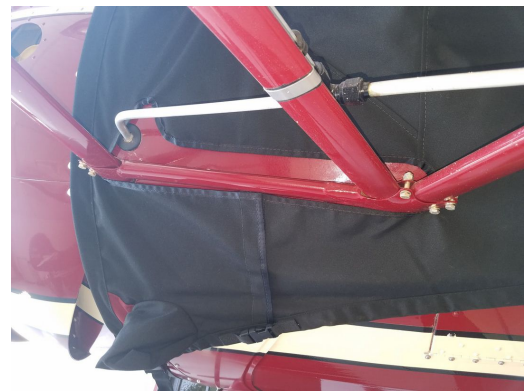
Waco UPF-7 Canopy Cover