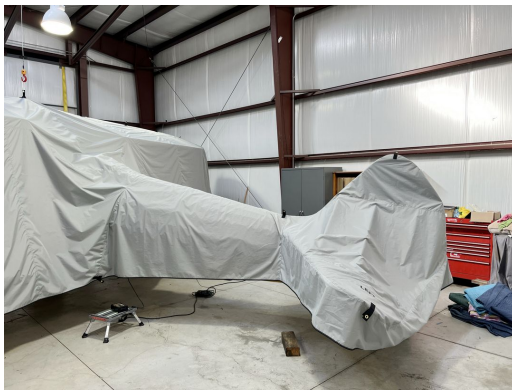
Stearman PT-13 Full Body Dust Cover, Prop Cover Included

Some high value aircraft end up logging lots of hangar time, and become dust magnets in the process. A high quality, well fitting dust cover provides easy assurance that the aircraft's surfaces remain clean and free of grit and grime. Available in a large variety of colors, each dust cover is custom made according to aircraft details and customer preferences. Fire retardant fabrics are also available.