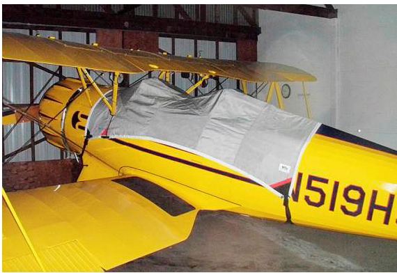
Waco YMF-5 Canopy Cover