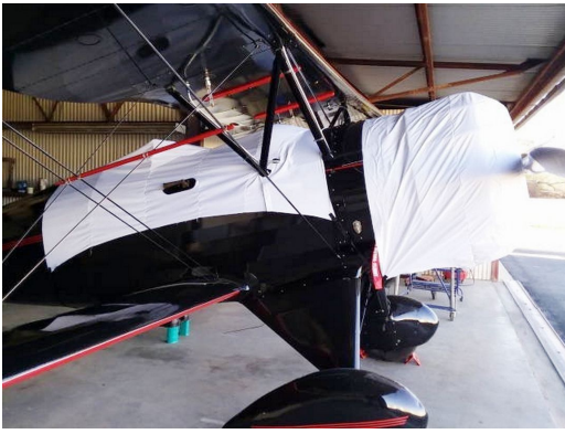
Waco UMF Canopy & Engine Covers, test fit prototypes