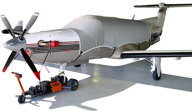
Beech Harpoon Canopy Cover, Exhaust Covers, Engine Plug PC-12 Canopy Cover, Engine Plugs, Prop Tie/Exhaust Covers