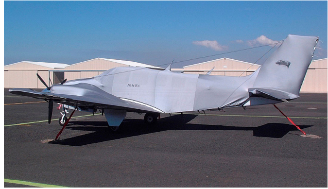
Baron FULL COVER SET, Light Weight Travel &/or Fitted Dust Cover Set