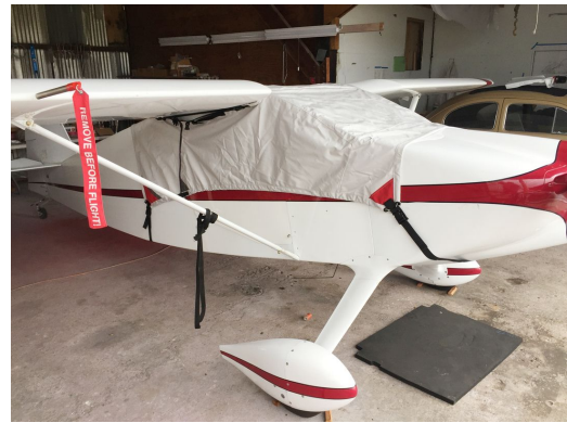
Wittman Tailwind Canopy Cover, Over-The-Top