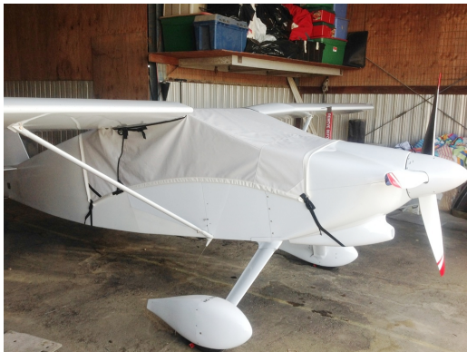
Wittman Tailwind Canopy Cover

This cover type is made from Silver Acrylic Sunbrella canvas and is 100% lined with a soft and smooth microfiber. Bruce's Custom Covers developed this material combination especially for aircraft protection. The outer material is medium weight and treated for water resistance, UV resistance and anti-static buildup. The inner lining is a very soft and smooth microfiber to prevent scratching. The material is very reflective, and tests show that the cabin interior temperature can be reduced to near-ambient temperature on the hottest of days. It is water, ice and snow repellent, yet breathable to allow moisture to escape from between the cover and the aircraft surface.