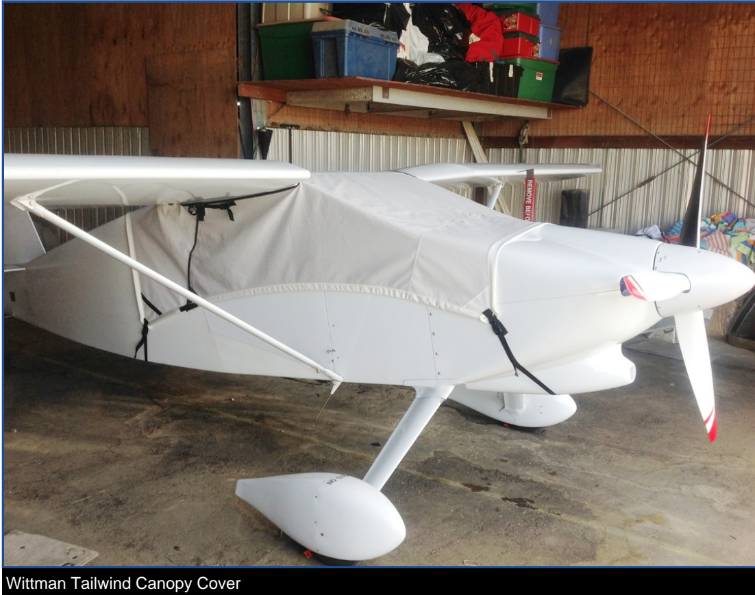
Wittman Tailwind Canopy Cover