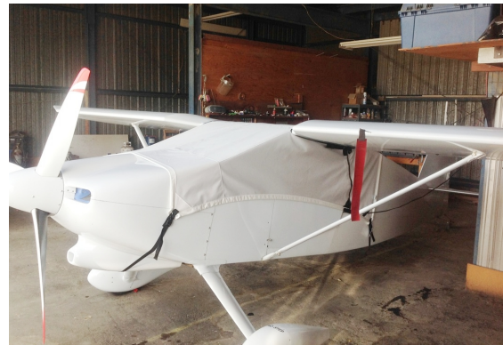
Wittman Tailwind Canopy Cover