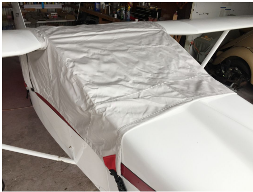
Wittman Tailwind Canopy Cover, Over-The-Top

This cover type is made from Silver Acrylic Sunbrella canvas and is 100% lined with a soft and smooth microfiber. Bruce's Custom Covers developed this material combination especially for aircraft protection. The outer material is medium weight and treated for water resistance, UV resistance and anti-static buildup. The inner lining is a very soft and smooth microfiber to prevent scratching. The material is very reflective, and tests show that the cabin interior temperature can be reduced to near-ambient temperature on the hottest of days. It is water, ice and snow repellent, yet breathable to allow moisture to escape from between the cover and the aircraft surface.