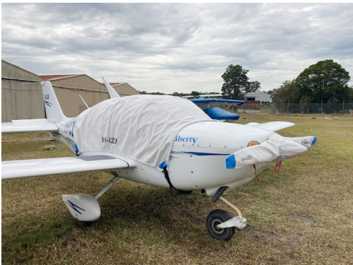
XL-2 CANOPY COVER