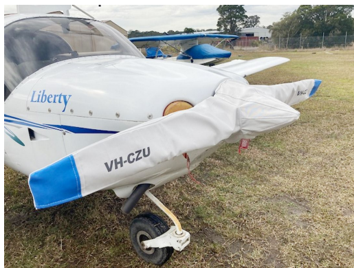
XL-2 PROPELLOR/SPINNER COVER

This cover type is made from Silver Acrylic Sunbrella canvas and is 100% lined with a soft and smooth microfiber. Bruce's Custom Covers developed this material combination especially for aircraft protection. The outer material is medium weight and treated for water resistance, UV resistance and anti-static buildup. The inner lining is a very soft and smooth microfiber to prevent scratching. The material is very reflective, and tests show that the cabin interior temperature can be reduced to near-ambient temperature on the hottest of days. It is water, ice and snow repellent, yet breathable to allow moisture to escape from between the cover and the aircraft surface.