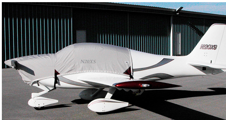
Canopy/Engine and Prop/Spinner Covers (tri-gear model)

Travel Covers are made with Silver Solution-Dyed Polyester fabric and only lined over the windshield to save weight. The material is lightweight and more compact for easy stowage in the aircraft. The polyester material is water resistant, but only intended for occasional use outside. We also have an ultra lightweight material available for fitted hangar dust covers. For daily outdoor use, the non-travel Sunbrella Cover is the best choice.