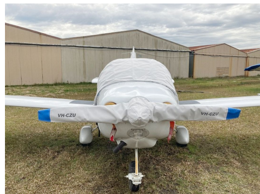
XL-2 PROPELLOR/SPINNER COVER