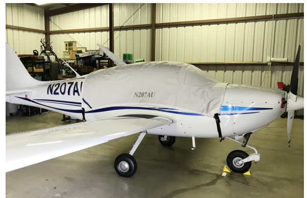
Liberty Aerospace Liberty XL-2 Canopy Cover