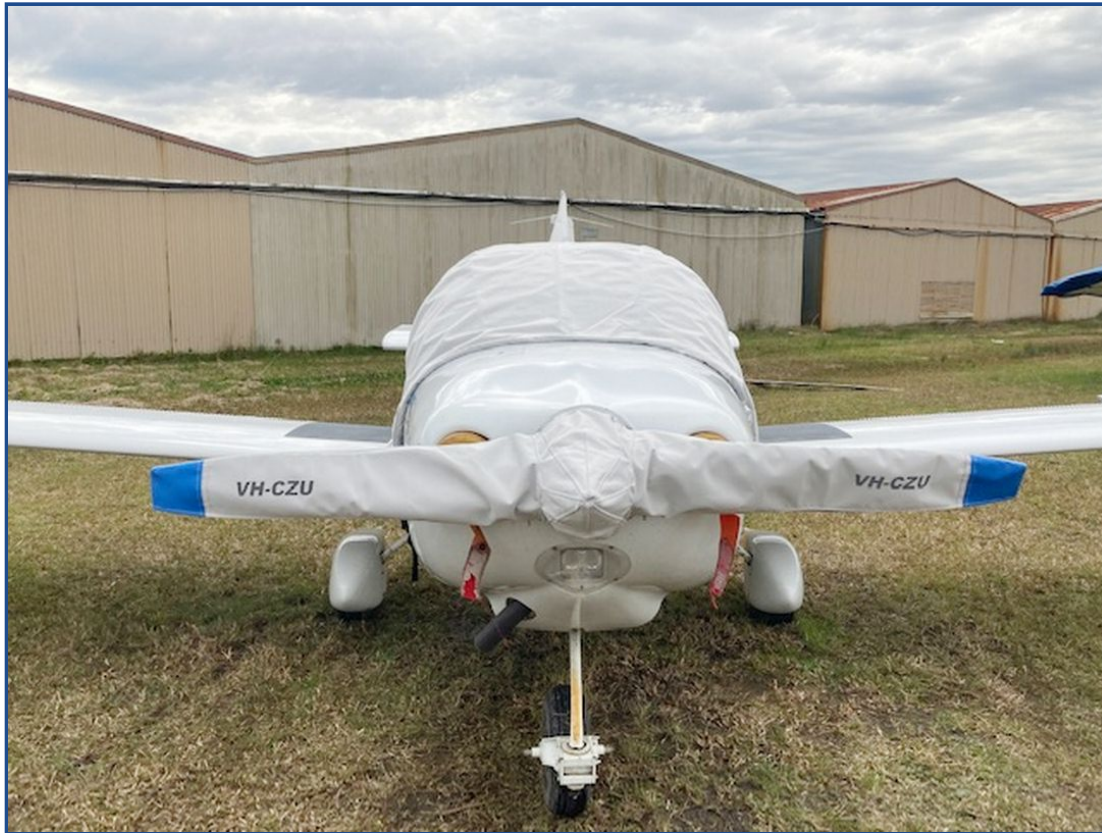
XL-2 PROPELLOR/SPINNER COVER