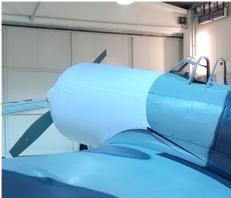
Yak 11 Engine Cover (test fit cover)