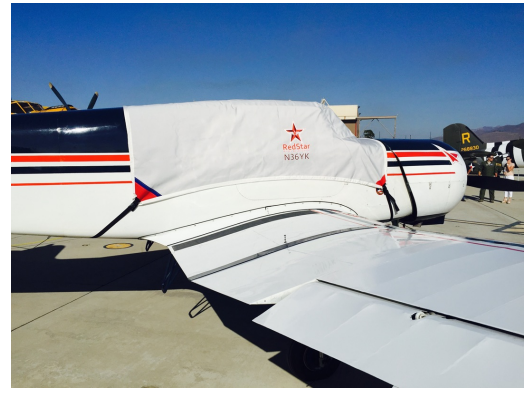
Yak 18 Canopy Cover