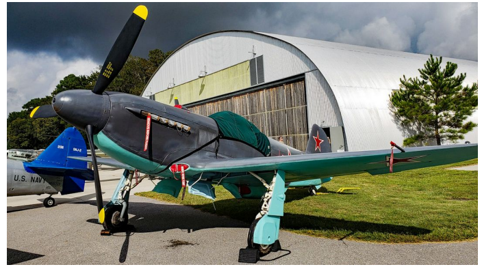
Yakovlev Yak 3 Oil Cooler Inlet Plugs (In Wing Root)