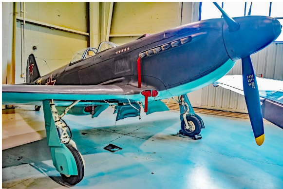
Yakovlev Yak 3 Oil Cooler Inlet Plugs (In Wing Root), Belly Scoop Plug

Engine Inlet Plugs are custom fit for your Yakovlev Yak 3 intakes, made with heavy-duty vinyl material, and stuffed with a single block of sculpted urethane foam. Each plug has a zipper that allows the foam to be removed and dried if necessary. Engine plugs have warning flags that are visible from the cockpit or 'remove before flight' streamers sewn onto the face of the plugs. Most plugs are imprinted with the aircraft registration number in black for an extra charge. Storage bag NOT included. Engine plugs may be inserted after flight when the engine is still warm. Engine Inlet Plugs are commonly referred to as Cowl Plugs, Intake Plugs, Cowl Blocks, Engine Blocks, and Engine Bungs.