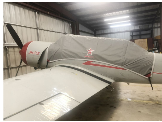
YAK 52TW Lightweight Travel Cover with Custom Artwork Imprint