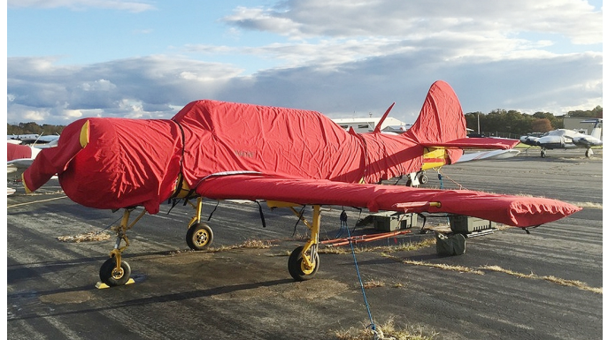
Yak 52 Full Cover Set