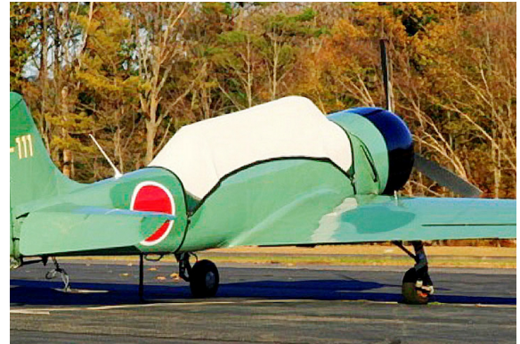
Yak 52 Canopy Cover