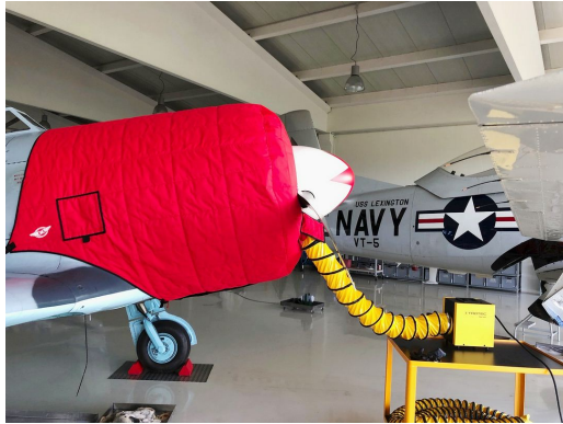
Yak 11 Insulated Engine Cover

This cover type is made from Silver Acrylic Sunbrella canvas and is 100% lined with a soft and smooth microfiber. Bruce's Custom Covers developed this material combination especially for aircraft protection. The outer material is medium weight and treated for water resistance, UV resistance and anti-static buildup. The inner lining is a very soft and smooth microfiber to prevent scratching. The material is very reflective, and tests show that the cabin interior temperature can be reduced to near-ambient temperature on the hottest of days. It is water, ice and snow repellent, yet breathable to allow moisture to escape from between the cover and the aircraft surface.