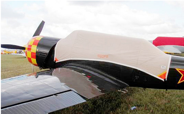
Yak 52 Canopy Cover

This cover type is made from Silver Acrylic Sunbrella canvas and is 100% lined with a soft and smooth microfiber. Bruce's Custom Covers developed this material combination especially for aircraft protection. The outer material is medium weight and treated for water resistance, UV resistance and anti-static buildup. The inner lining is a very soft and smooth microfiber to prevent scratching. The material is very reflective, and tests show that the cabin interior temperature can be reduced to near-ambient temperature on the hottest of days. It is water, ice and snow repellent, yet breathable to allow moisture to escape from between the cover and the aircraft surface.