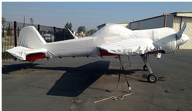
Yak 55 Full Fuselage Cover w/ Detachable Wing Covers & Propellor/Spinner Cover

reflective, and tests show that the cabin interior temperature can be reduced to near-ambient temperature on the hottest of days. It is water, ice and snow repellent, yet breathable to allow moisture to escape from between the cover and the aircraft surface.