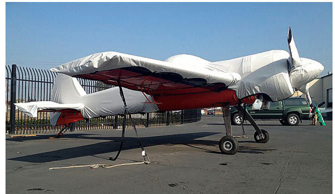
Yak 55 Full Fuselage Cover w/ Detachable Wing Covers & Propellor/Spinner Cover