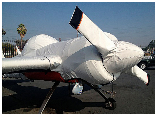
Yak 55 Full Fuselage Cover w/ Detachable Wing Covers & Propellor/Spinner Cover