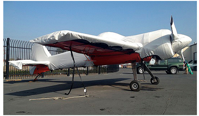
Yak 55 Full Fuselage Cover w/ Detachable Wing Covers & Propellor/Spinner Cover