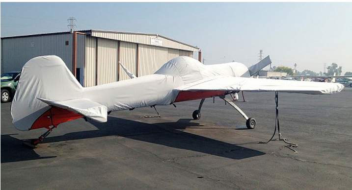
Yak 55 Full Fuselage Cover w/ Detachable Wing Covers & Propellor/Spinner Cover

This cover type is made from Silver Acrylic Sunbrella canvas and is 100% lined with a soft and smooth microfiber. Bruce's Custom Covers developed this material combination especially for aircraft protection. The outer material is medium weight and treated for water resistance, UV resistance and anti-static buildup. The inner lining is a very soft and smooth microfiber to prevent scratching. The material is very reflective, and tests show that the cabin interior temperature can be reduced to near-ambient temperature on the hottest of days. It is water, ice and snow repellent, yet breathable to allow moisture to escape from between the cover and the aircraft surface.