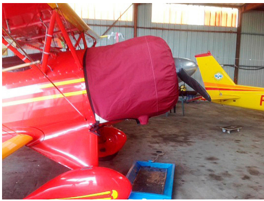
Waco Engine Cover