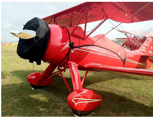
Waco UPF-7 Canopy & Engine Cover