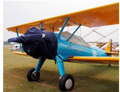
Stearman Canopy, Engine & Prop Covers