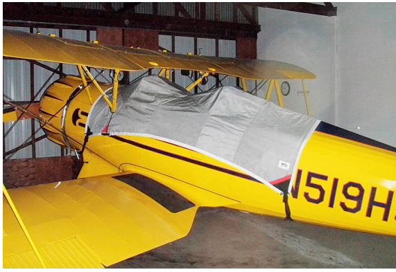
The Waco YMF Canopy Cover