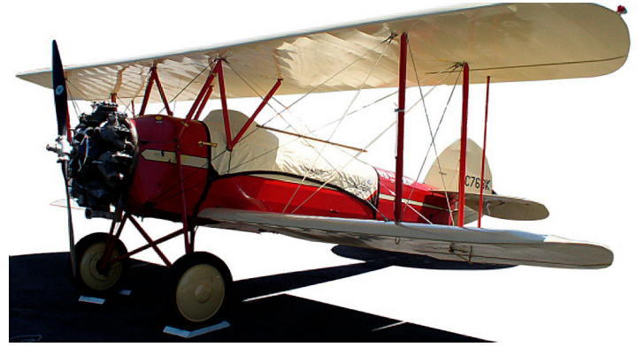
Waco 10 Canopy Cover