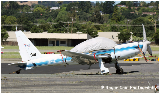
Lockheed YO-3 Canopy and Propellor/Spinner Cover