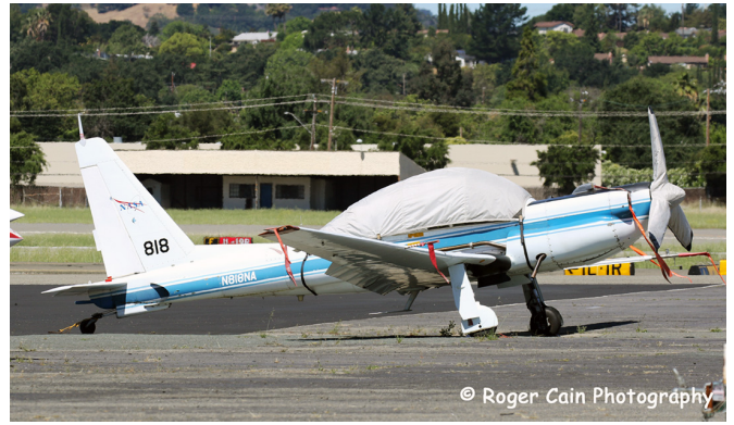
Lockheed YO-3 Canopy and Propellor/Spinner Cover