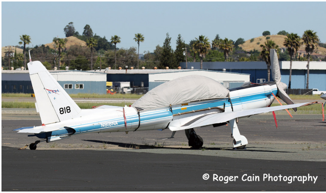
Lockheed YO-3 Canopy and Propellor/Spinner Cover