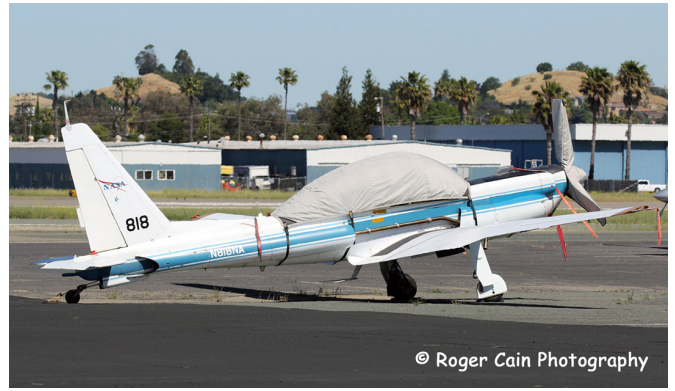
Lockheed YO-3 Canopy and Propellor/Spinner Cover