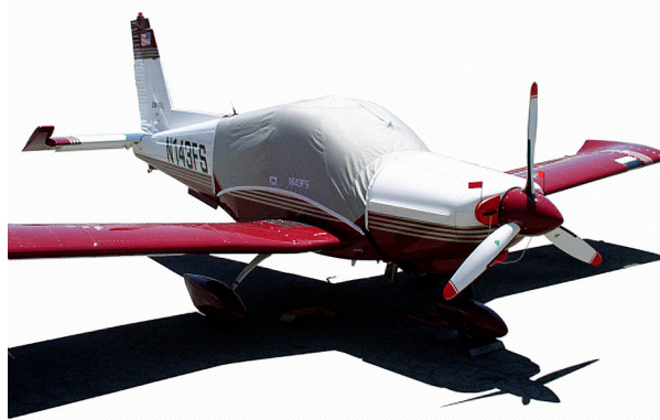
Zlin 143 Canopy Cover and Engine Plugs

This cover type is made from Silver Acrylic Sunbrella canvas and is 100% lined with a soft and smooth microfiber. Bruce's Custom Covers developed this material combination especially for aircraft protection. The outer material is medium weight and treated for water resistance, UV resistance and anti-static buildup. The inner lining is a very soft and smooth microfiber to prevent scratching. The material is very reflective, and tests show that the cabin interior temperature can be reduced to near-ambient temperature on the hottest of days. It is water, ice and snow repellent, yet breathable to allow moisture to escape from between the cover and the aircraft surface.