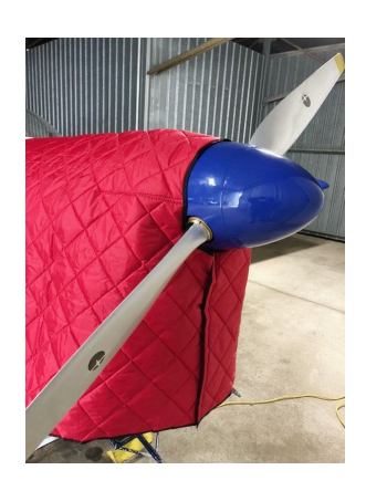
Zlin 142 Insulated Hangar Blanket