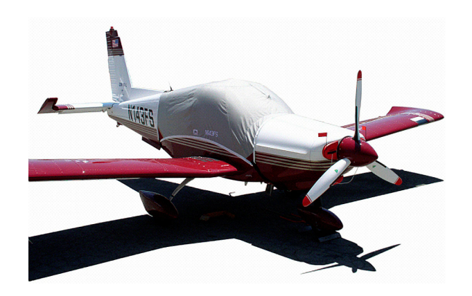
Zlin 143 Canopy Cover and Engine Plugs