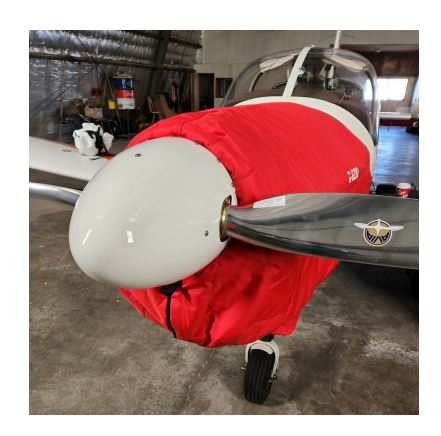
ZLIN 142C Insulated Engine Cover

This cover type is made from Silver Acrylic Sunbrella canvas and is 100% lined with a soft and smooth microfiber. Bruce's Custom Covers developed this material combination especially for aircraft protection. The outer material is medium weight and treated for water resistance, UV resistance and anti-static buildup. The inner lining is a very soft and smooth microfiber to prevent scratching. The material is very reflective, and tests show that the cabin interior temperature can be reduced to near-ambient temperature on the hottest of days. It is water, ice and snow repellent, yet breathable to allow moisture to escape from between the cover and the aircraft surface.