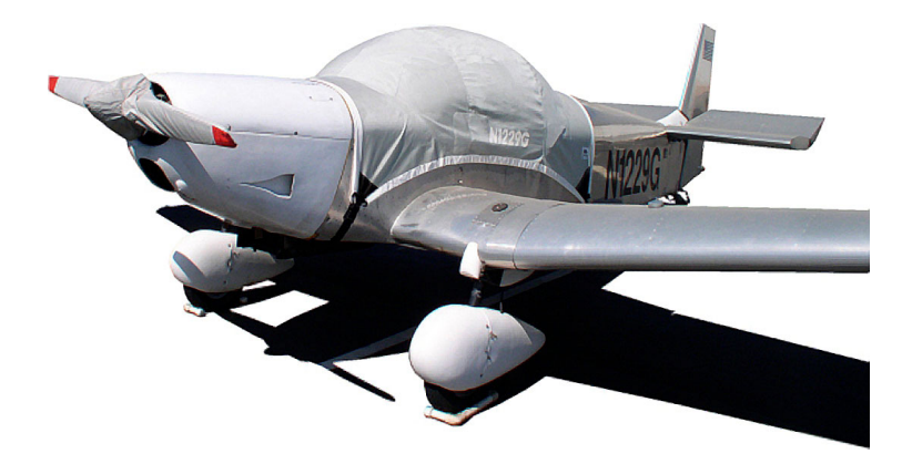
Zenith CH601 Canopy Cover & Prop Cover

This cover type is made from Silver Acrylic Sunbrella canvas and is 100% lined with a soft and smooth microfiber. Bruce's Custom Covers developed this material combination especially for aircraft protection. The outer material is medium weight and treated for water resistance, UV resistance and anti-static buildup. The inner lining is a very soft and smooth microfiber to prevent scratching. The material is very reflective, and tests show that the cabin interior temperature can be reduced to near-ambient temperature on the hottest of days. It is water, ice and snow repellent, yet breathable to allow moisture to escape from between the cover and the aircraft surface.