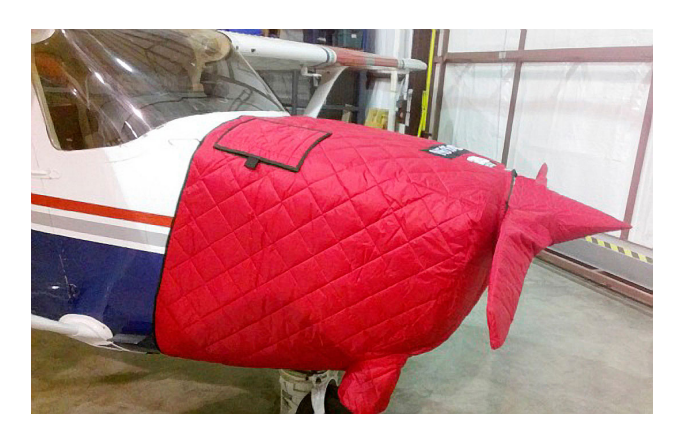
Cessna 172 Insulated Engine Cover w/ Oil Filler Door flap and Insulated Prop/Spinner Cover