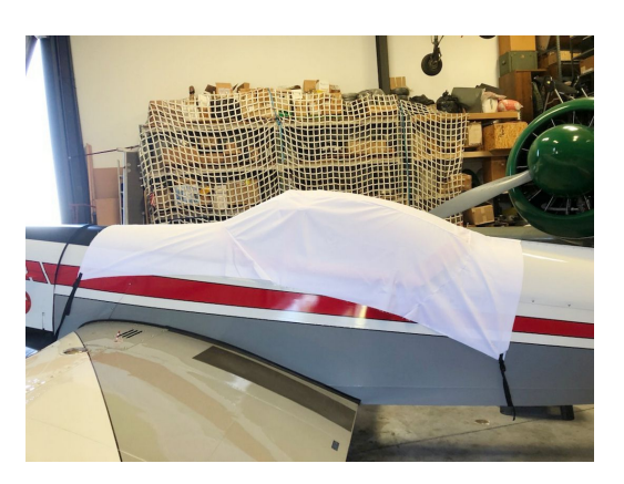
Zlin 526 Canopy Cover, test fit cover

the hottest of days. It is water, ice and snow repellent, yet breathable to allow moisture to escape from between the cover and the aircraft surface.